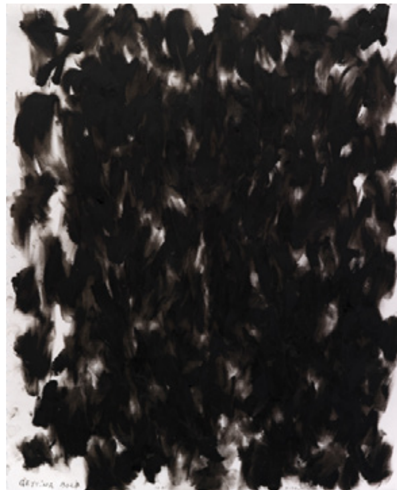
Getting Bold 2003 -- técnica mista sobre papel/mixed media on paper -- 43.3 x 35.6 cm