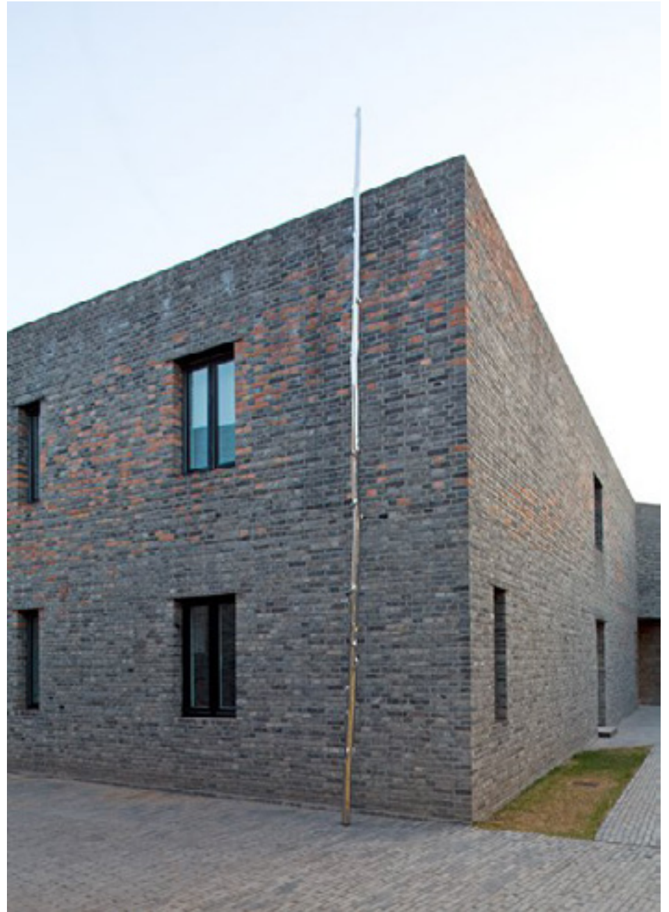
Leading the Way 2012 -- aço inox/stainless steel -- 777 x ø 16 cm