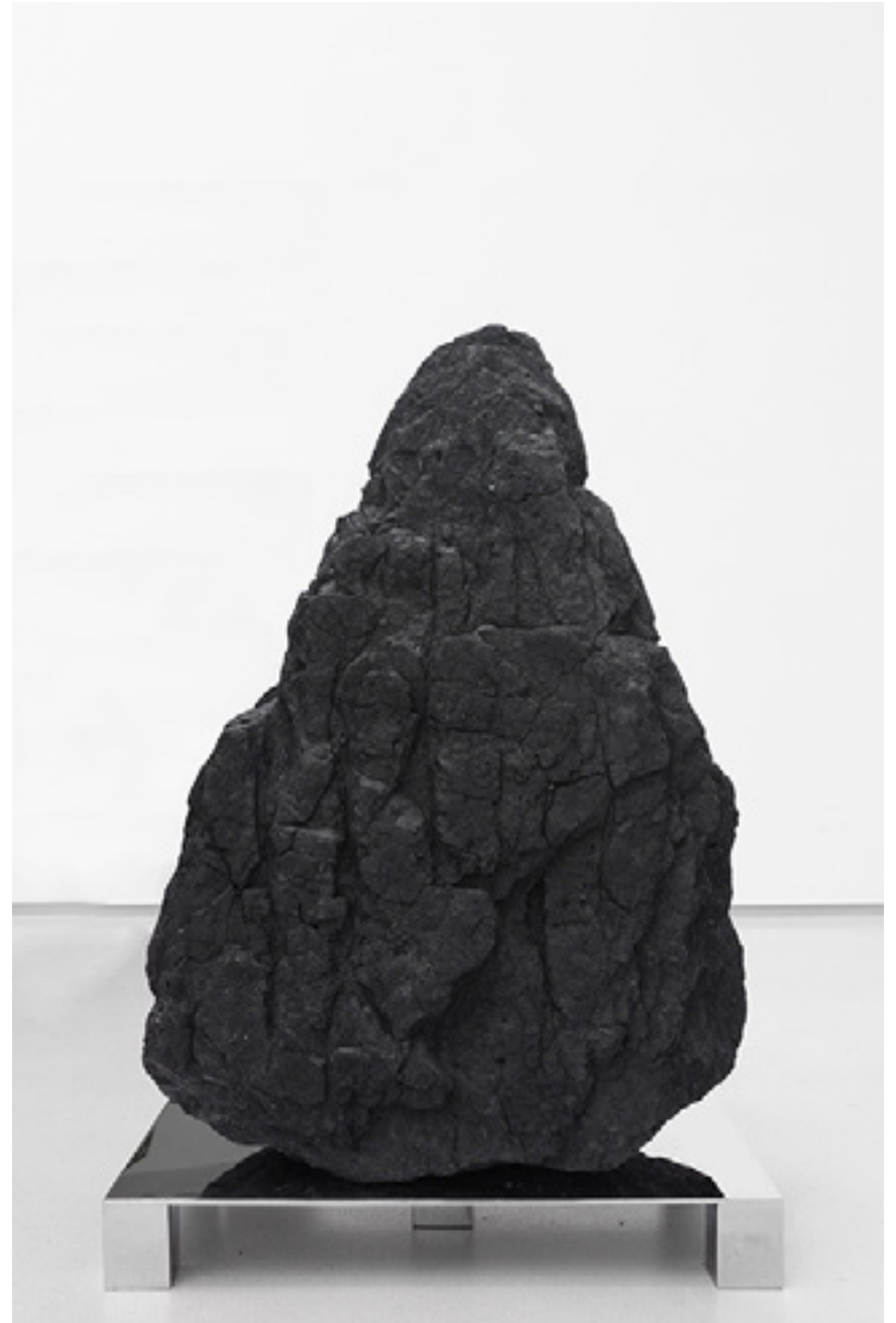
Piz Nair 2011 -- carvão e aço inox/coal and stainless steel -- 102 x 70 x 49 cm