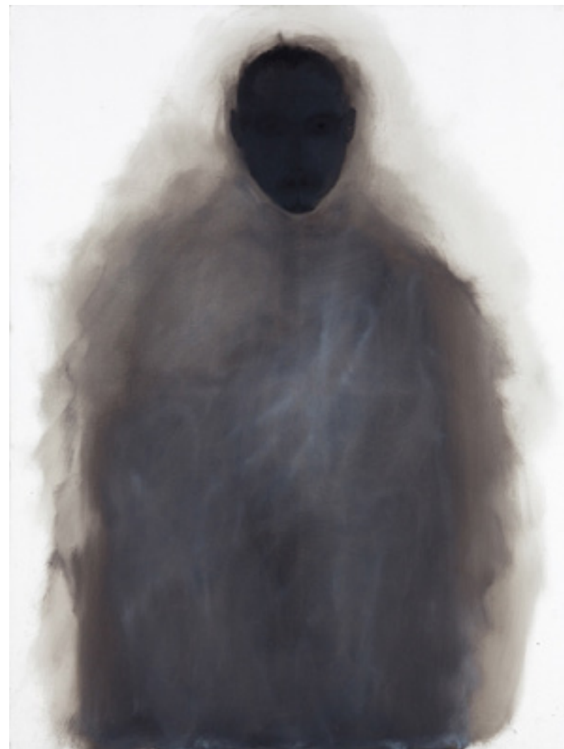
Li Gao 2012 -- óleo sobre tela/oil on canvas -- 138 x 107,3 cm