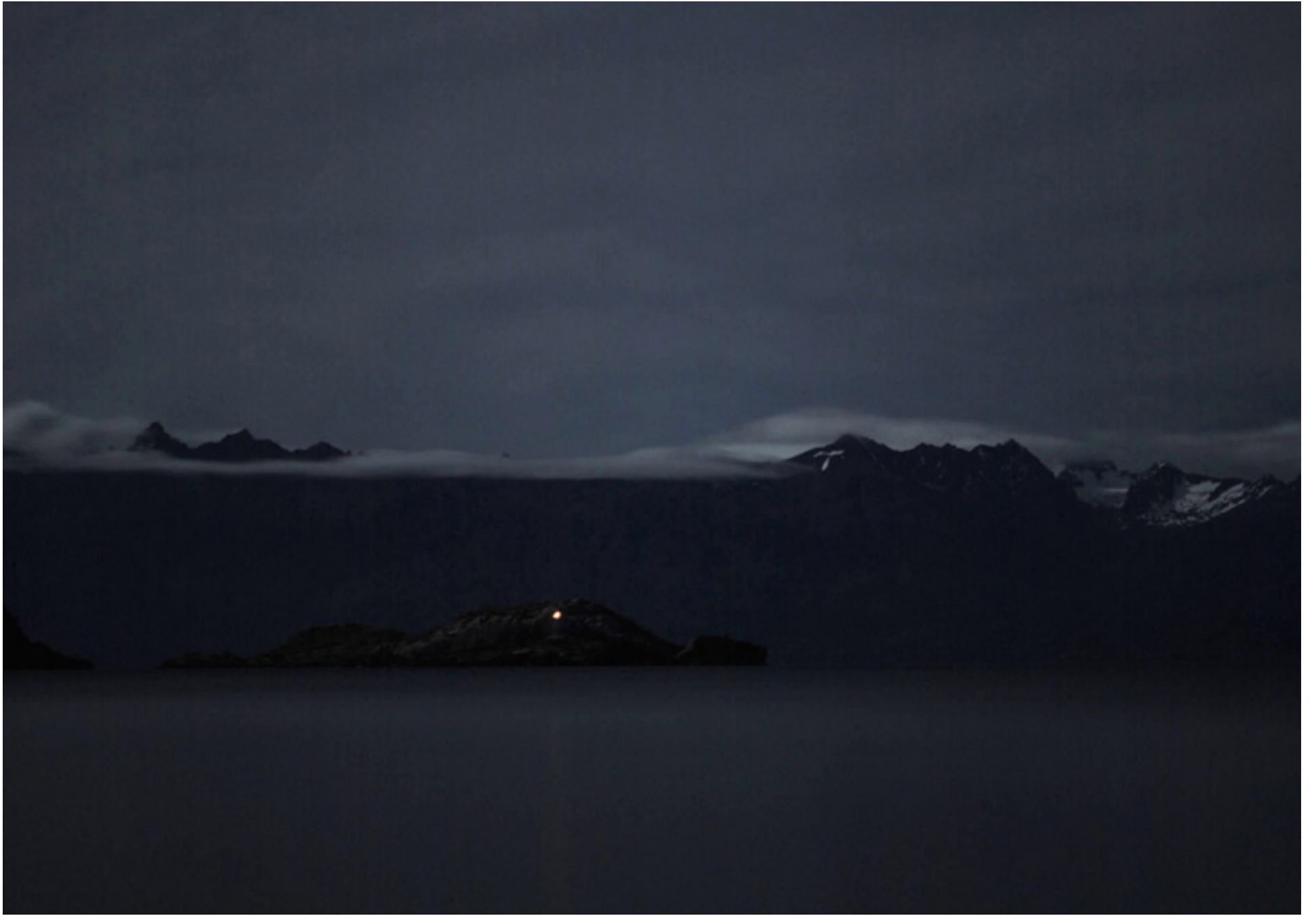
NotOna Island 2009 -- Patagonia, Chile