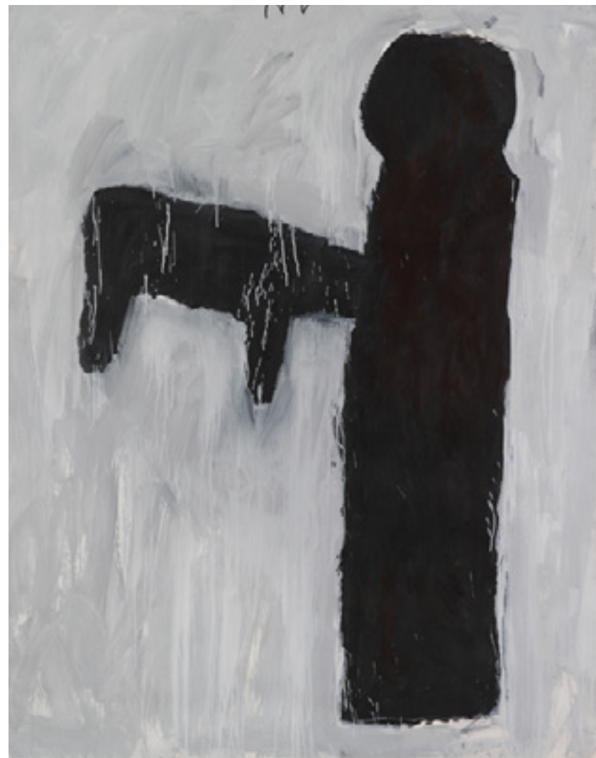
sem título/untitled 1986 -- acrílica, grafite, óleo/acrylic, graphite, oil-stick on paper -- 191.5 x 152.5 cm