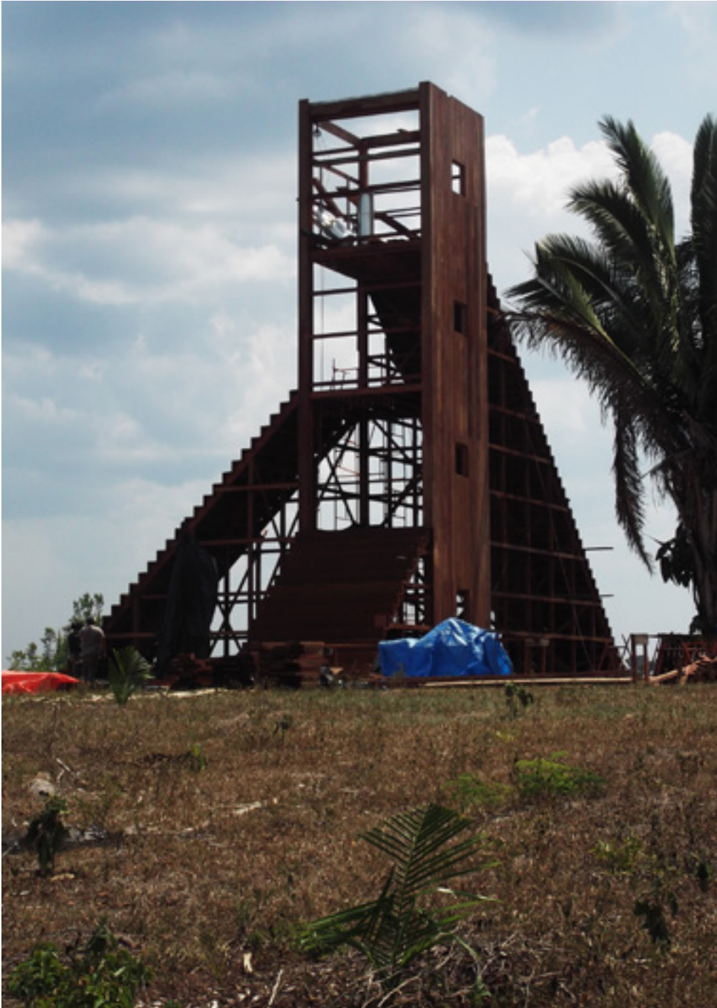
House to Watch the Sunset 2015 -- under construction -- Paraná do Mamori