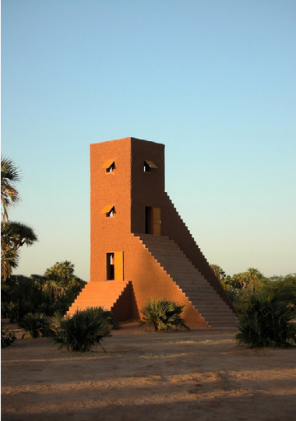
Sunset House 2005 -- Agadez, Niger