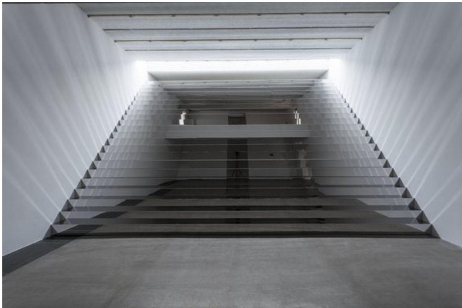
Sta(i)r(e) 2013 -- aço inox/stainless steel --528 x 860 x 568 cm