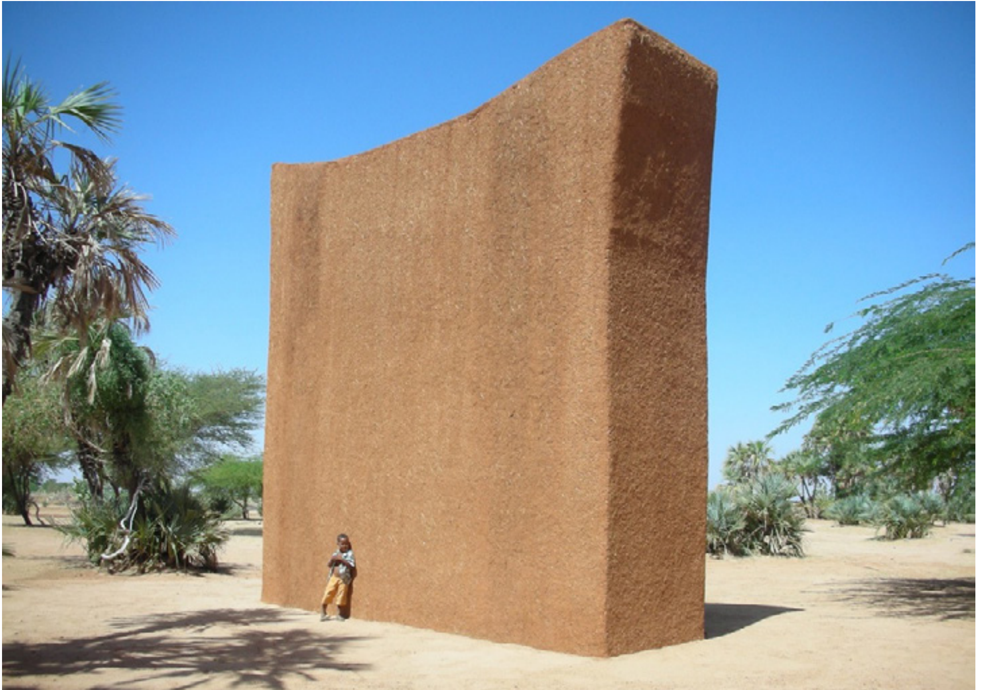
Moon House 2006 -- Agadez, Niger