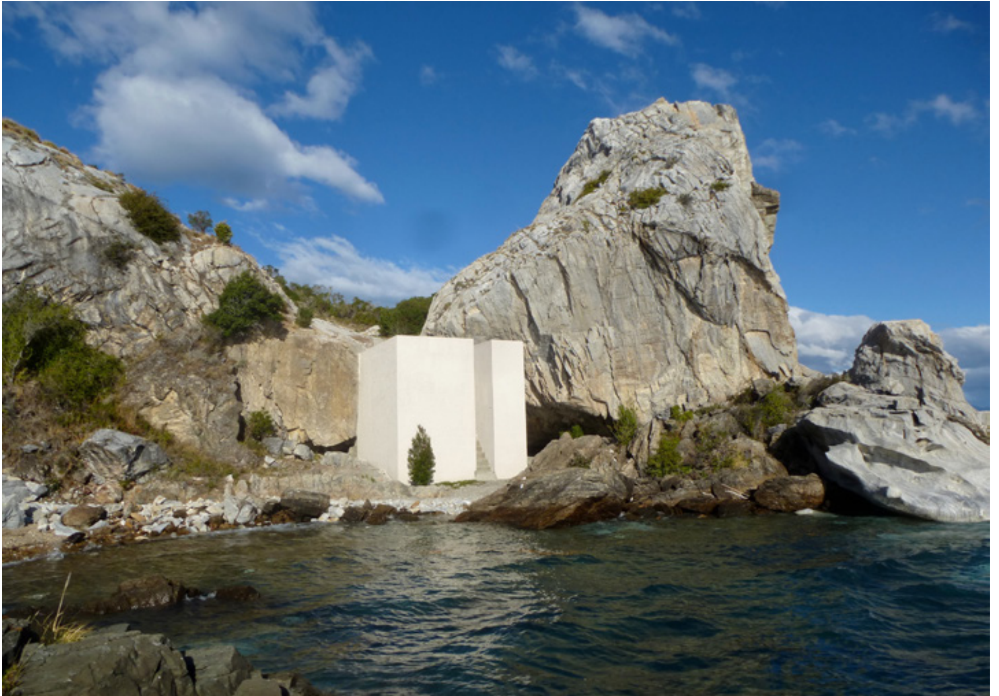
NotOna Island 2009 -- Patagonia, Chile