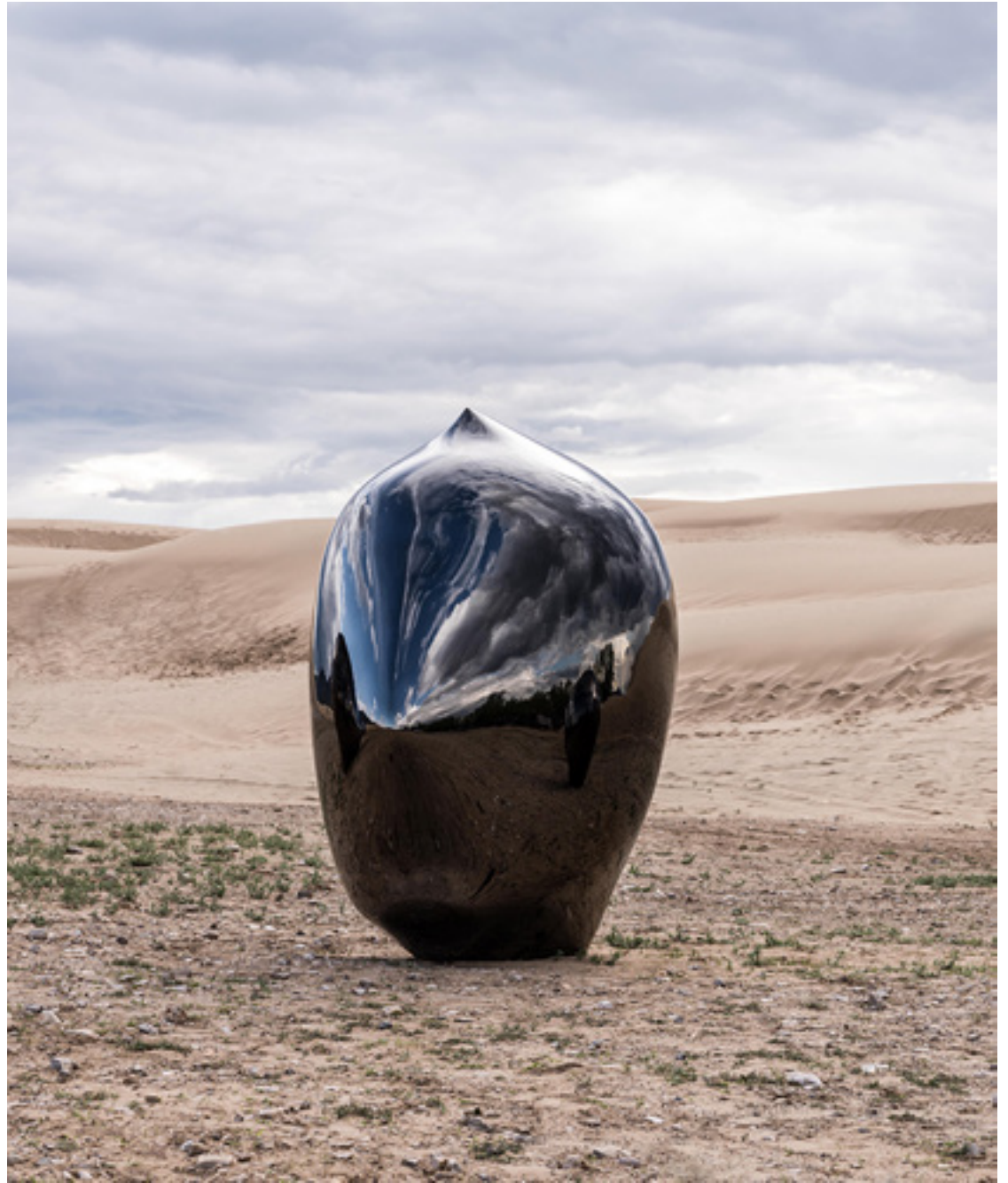
Head selfportrait 2013 -- aço inox revestido em PVD/stainless steel with PVD coating -- 190 x 160 x 125 cm