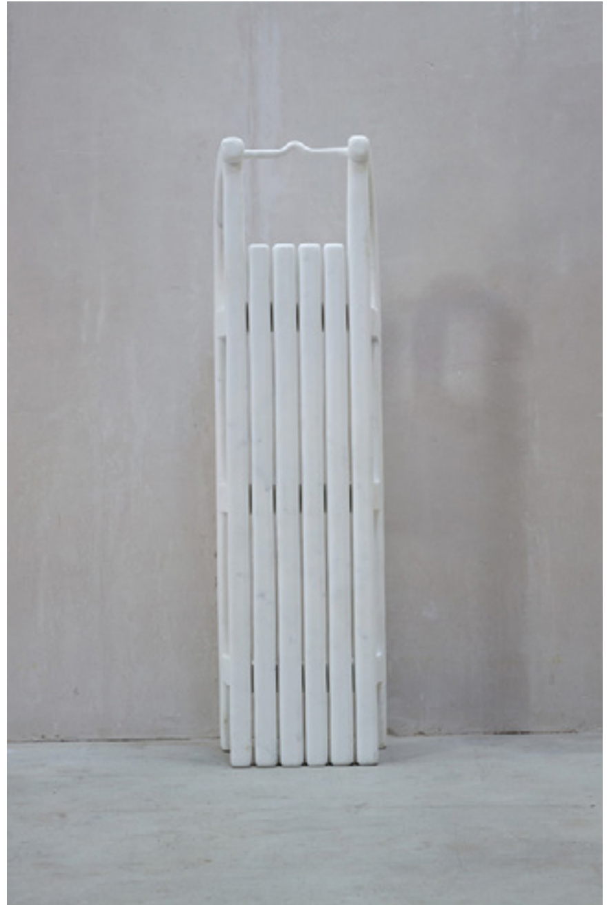
Sled 2003 -- mármore carrara/carrara marble -- 150 x 30 x 40 cm