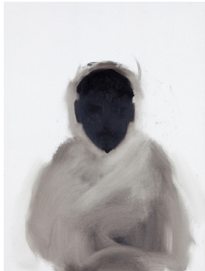
Young Rembrandt 2010 -- óleo sobre tela/oil on canvas -- 73 x 53 cm