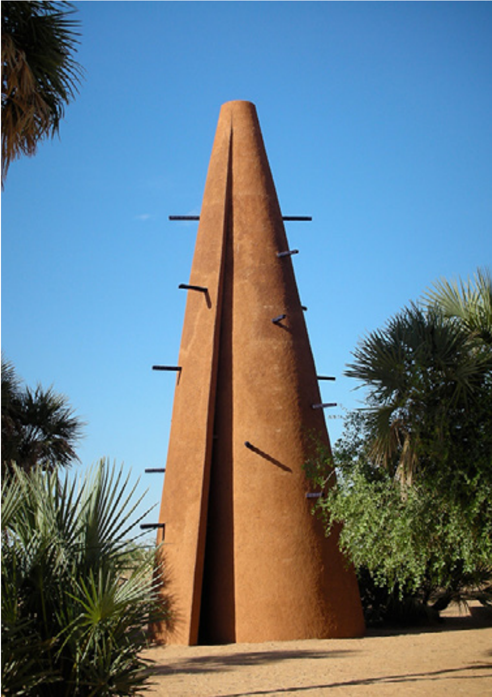
Sandstorm House 2006 -- Aladab, Niger