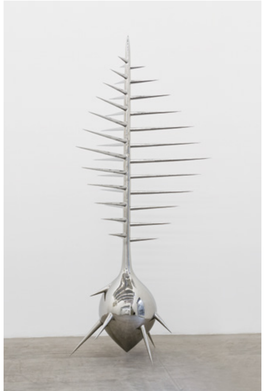
Unpleasant Object 2008 -- aço inox/stainless steel -- 315 x 145 x 143 cm