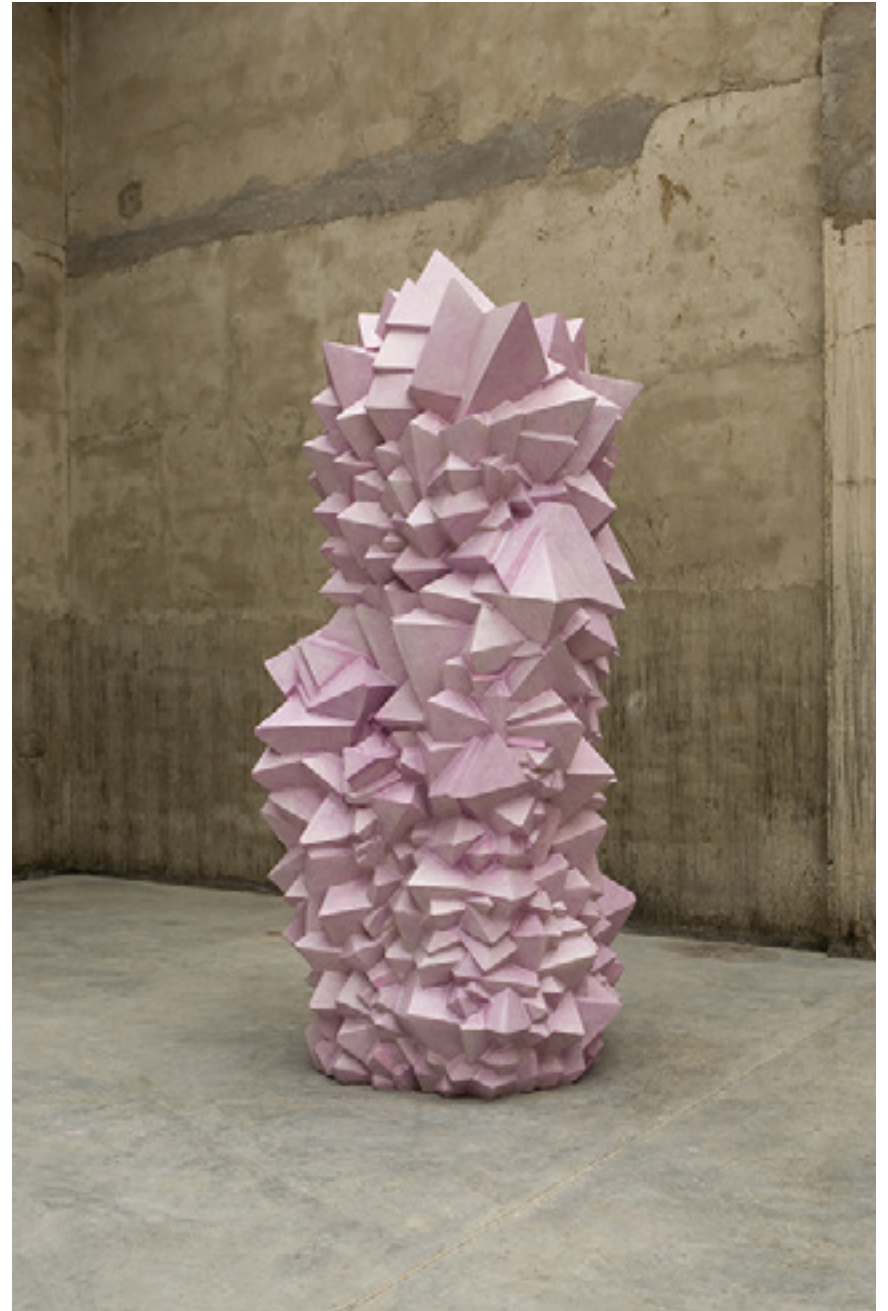
625 2010 -- fibra de vidro e sabão/fiberglass and soap -- 300 x 150 x 140 cm