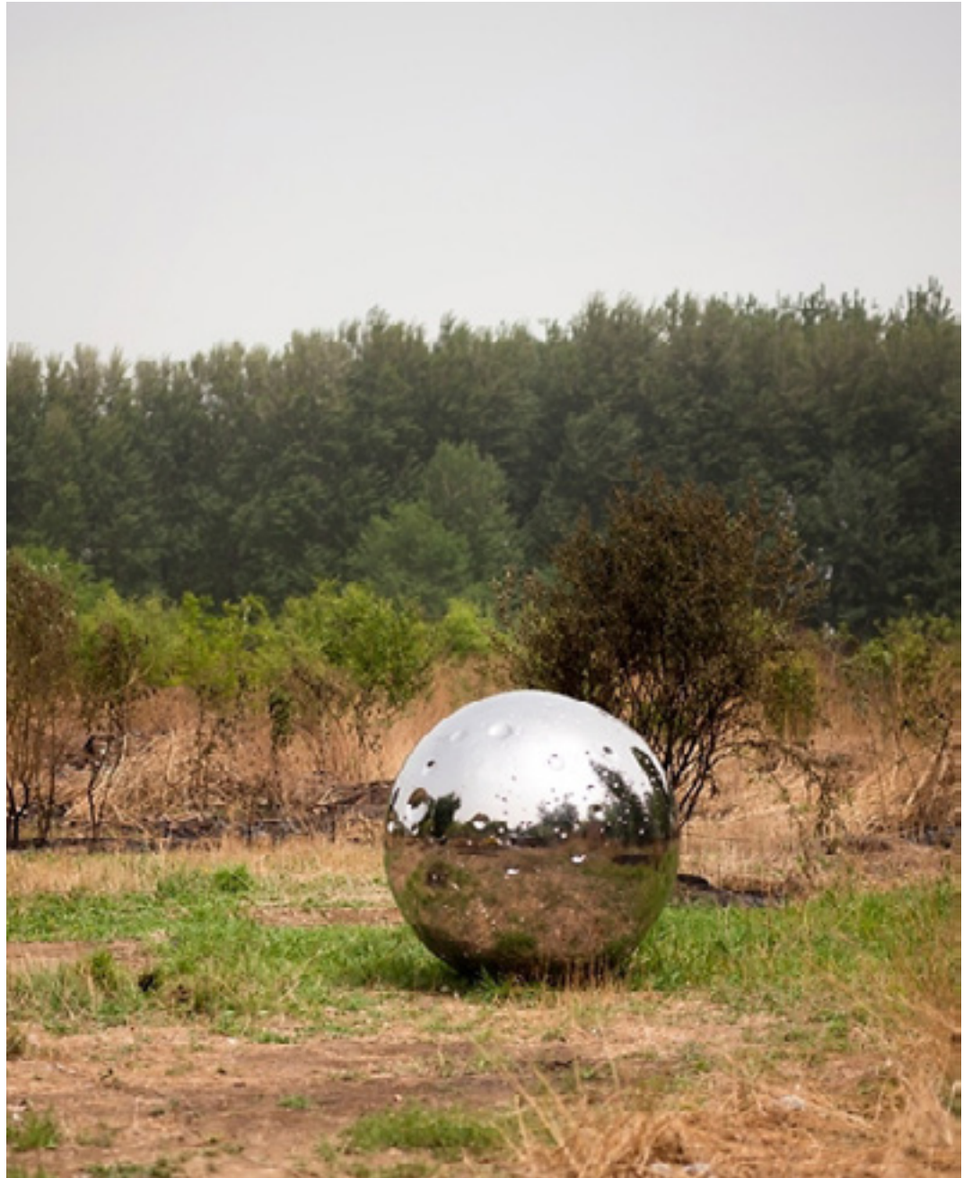
Moon No 2 2011 -- aço inox/stainless steel -- 170 ø