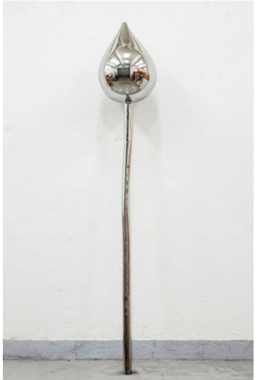
Lotus Blumen 2007 -- alumínio/aluminium -- 300 x 50 x 50 cm