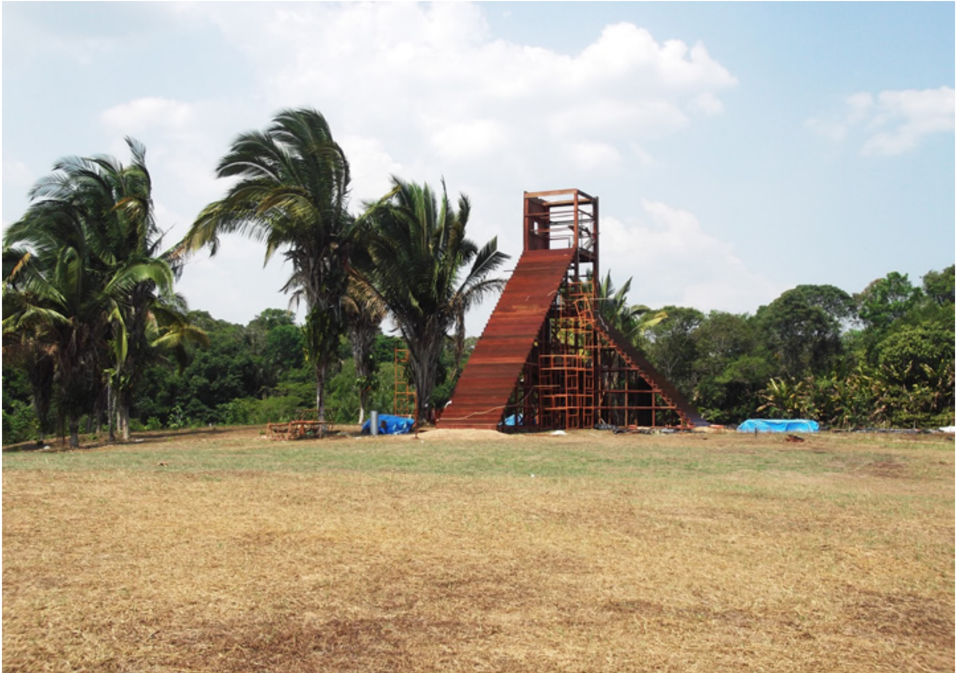
House to Watch the Sunset 2015 -- under construction -- Paraná do Mamori