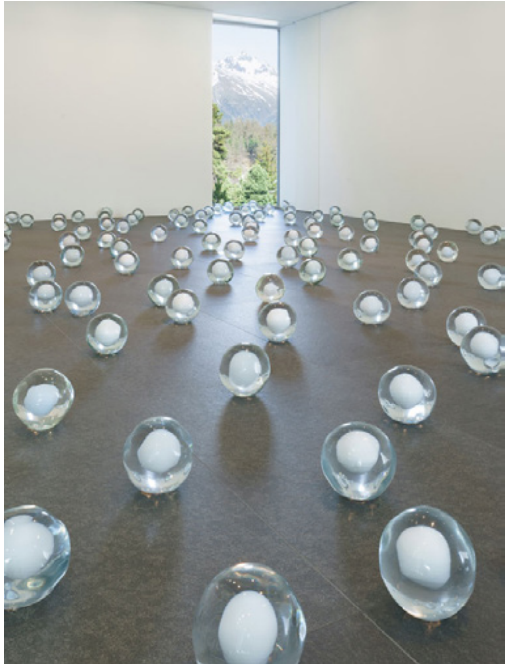
700 Snowballs 2015 -- 700 peças de vidro soprado/700 individually blown glass balls