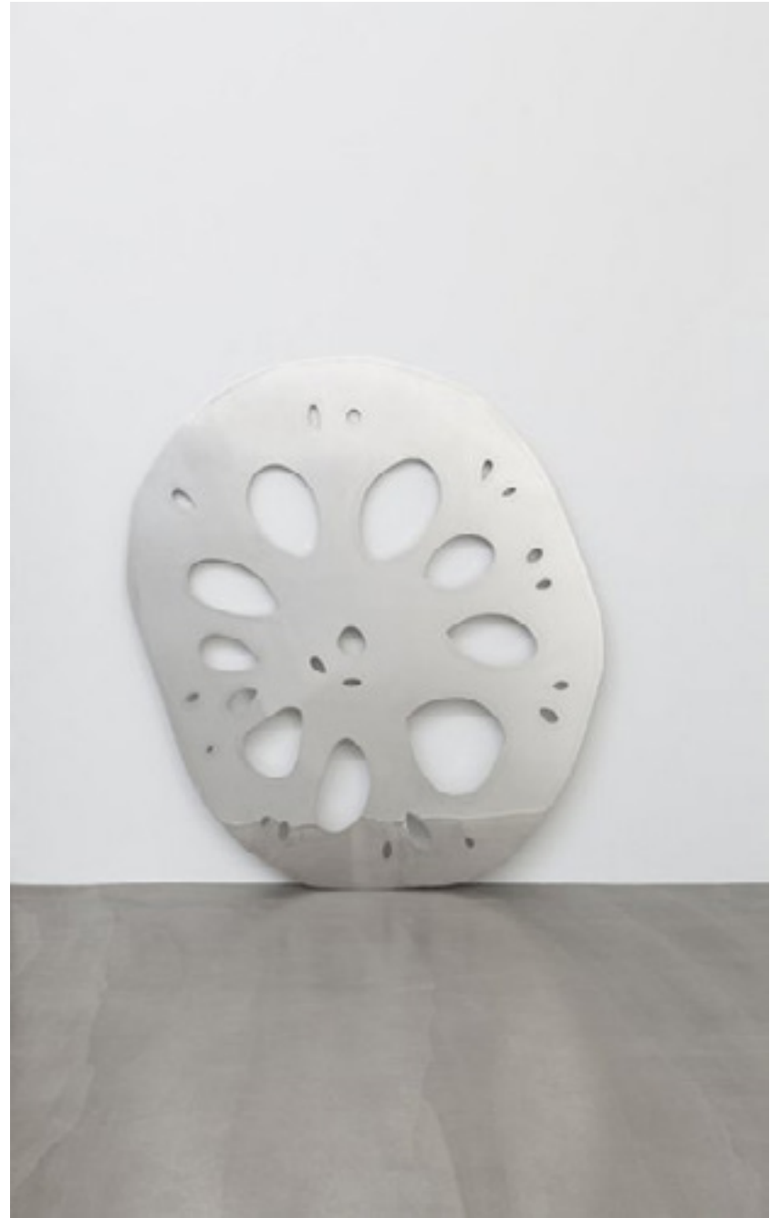
Ou 2013 -- aço inox/stainless steel -- 297 x 770 x 25 cm