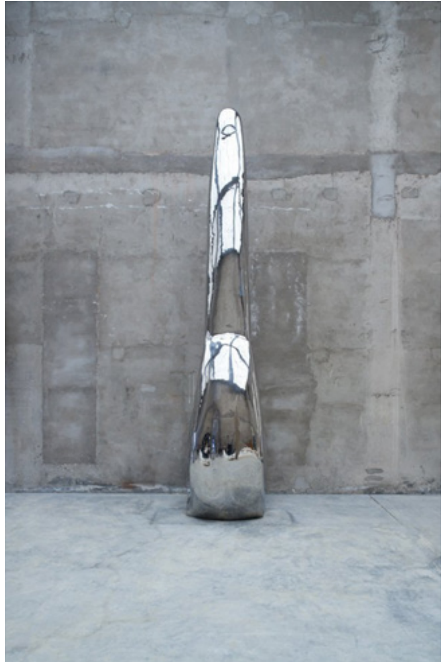
Tongue 2010 -- aço inox/stainless steel -- 520 x 105 x 125 cm