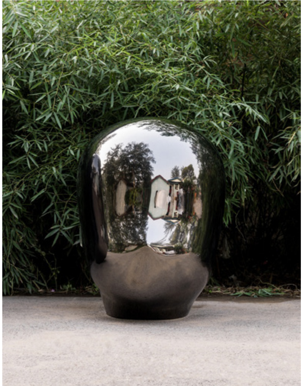
Head Qinlang 2014 -- aço inox revestido em PVD/stainless steel with PVD coating -- 112 x 92 x 107 cm