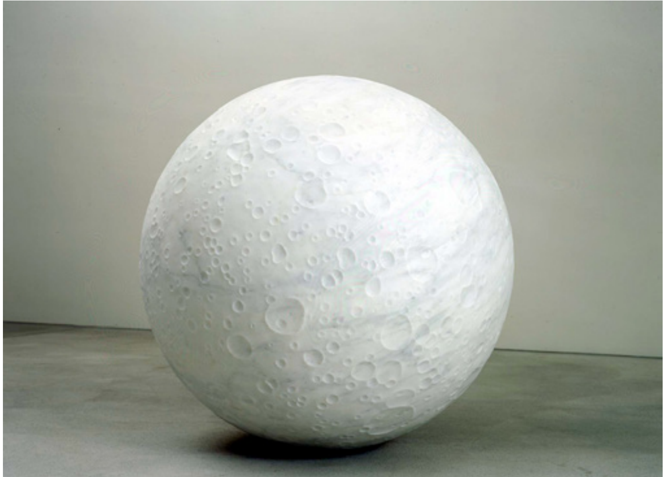
Moon 2004 -- mármore carrara/carrara marble -- 140 ø