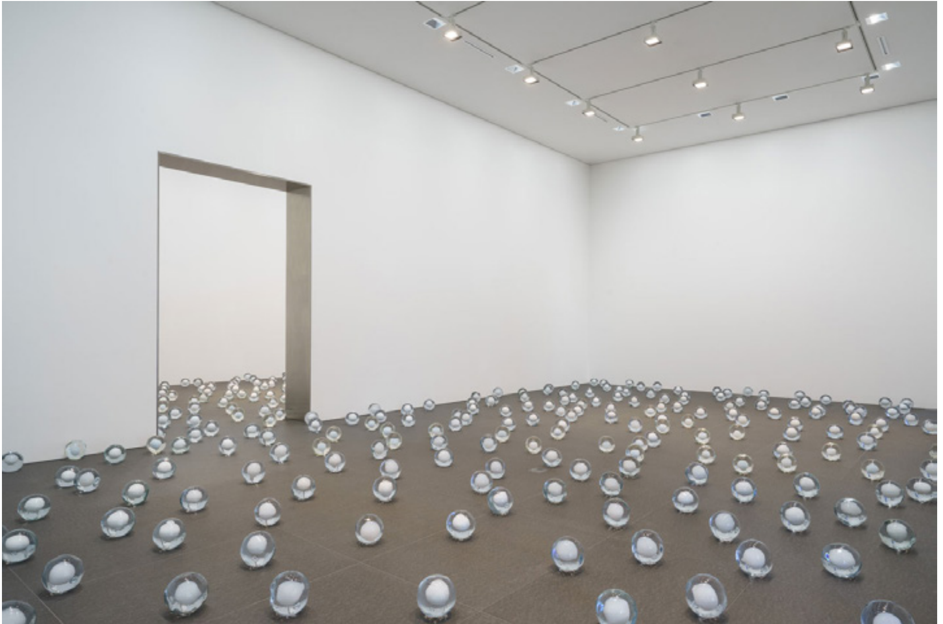
700 Snowballs 2015 -- 700 peças de vidro soprado/700 individually blown glass balls