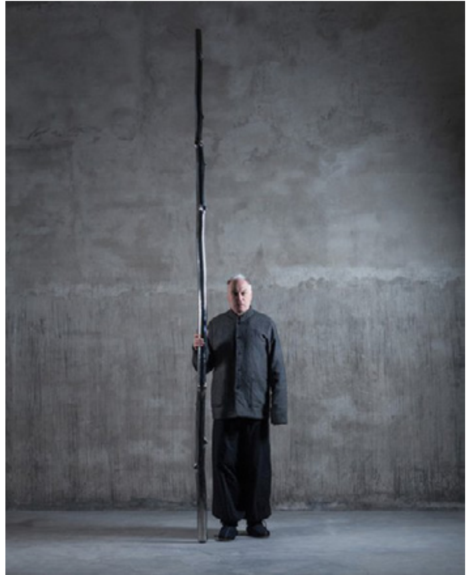
Walking Stick 2012 -- aço inox/stainless steel -- 349 x ø 10 cm