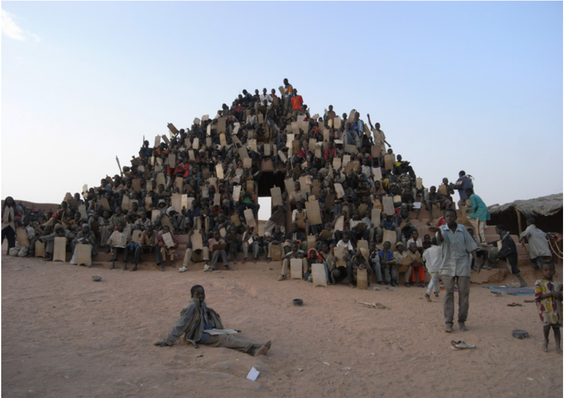
Makaranta School 2003 -- Agadez, Niger