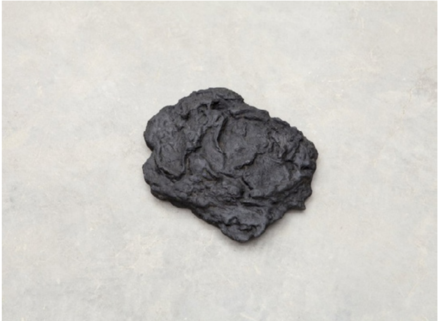
(Mongolian) Cow Dung 2013 -- bronze/bronze -- 4 x 28 x 22 cm