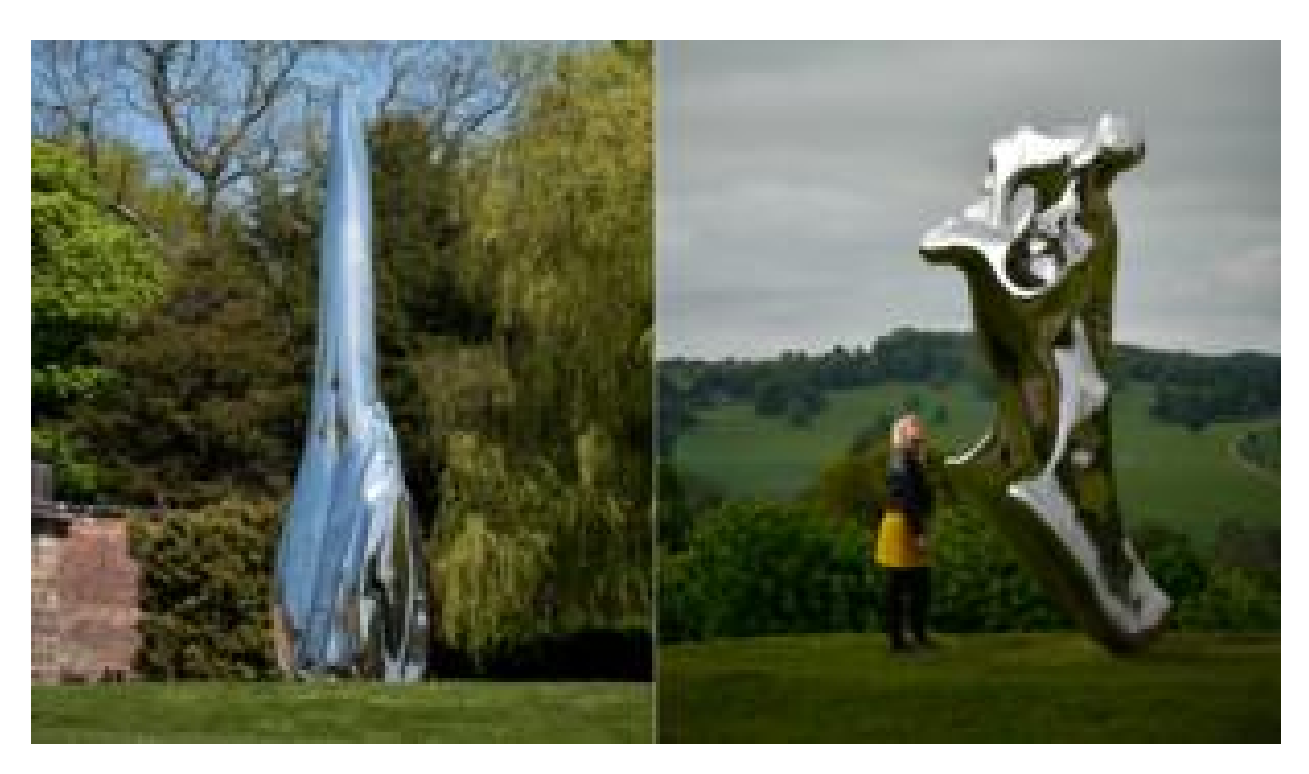
One of the most striking pieces, 2010's Tongue, certainly does not lose. A stainless steel representation of a cow's tongue, rising nearly 8m into the air, it is a striking and slightly unnerving work, as is 2008's Pelvis, which stands at more than 3m.