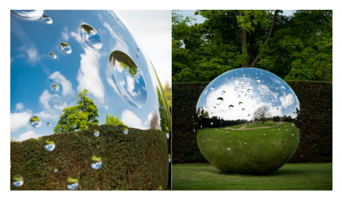
Not Vital says it is the first time some of the sculptures have been shown outside, something which concerns him because 'usually it loses because if you put a 7m sculpture next to a 13m tree, the tree wins'.