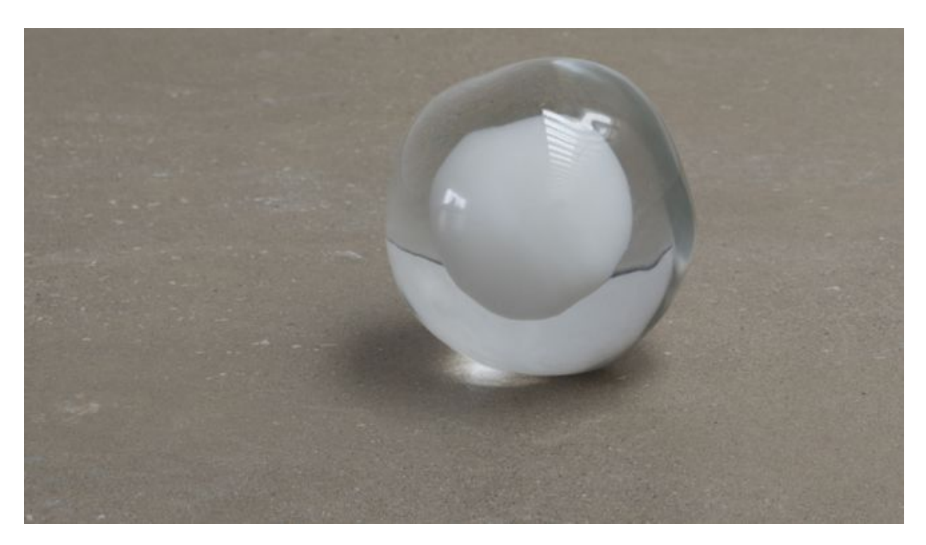
The exhibition contains everything from small works like 1999's Snowball – a glass ball apparently containing a sphere of snow – to huge pieces, shown both in the park's Underground Gallery and out in the open air.