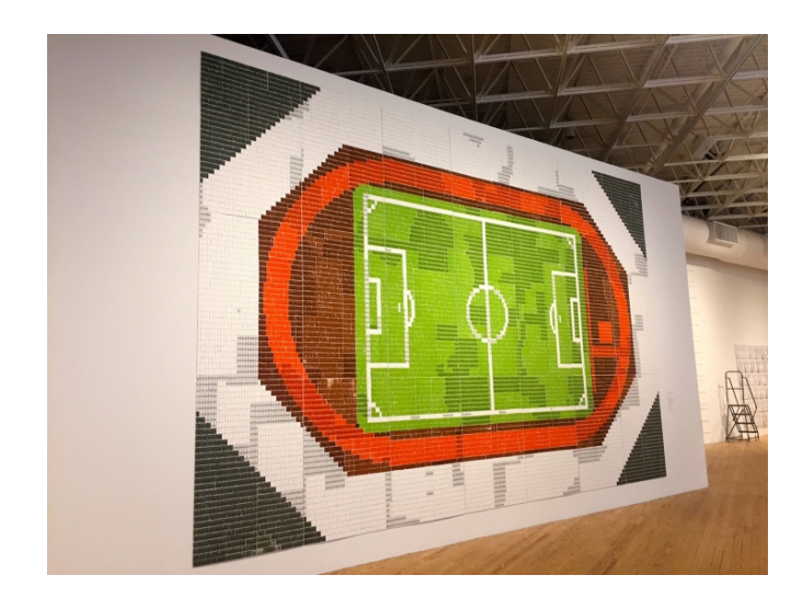
Paul Ramírez Jonas, "Assembly: Ghazi Stadium" (2013), silk screen and collage on paper

taxonomy of places for public assembly. The massive "Assembly: Ghazi Stadium" (2013), for instance, uses different colored tickets to represent the 25,000 bodies that can be seated in the Kabul, Afghanistan stadium. Ghazi Stadium is a venue for soccer games and other sports. But during Taliban rule in the 1990s, the stadium was the site of public executions.