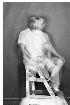
capturas de ellos , 2015 gelatin silver on paper 200 x 100 cm