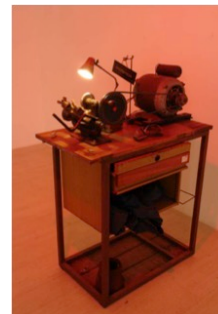
hermética , 2010 mixed media variable dimensions

press office usa sutton pr t 1 (212) 202 3402 julia lukacher, julia@suttonpr.com