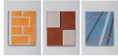
untitled , 2016 oil and wax on linen 30 x 24 cm each

For more information, please contact the gallery: comunicacao@nararoesler.com.br