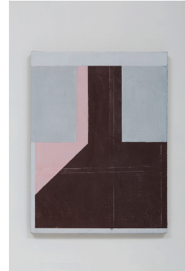
untitled , 2015 oil and wax on linen 40 x 30 cm