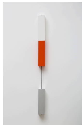
untitled oil and vinil on canvas 99,5 x 6,5 cm