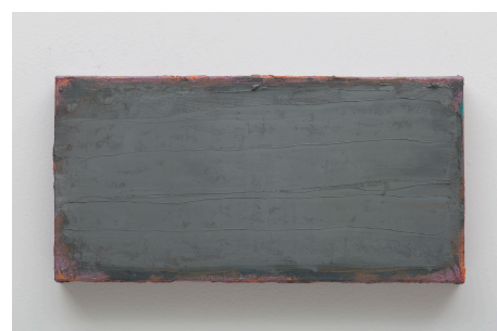
untitled oil on canvas 20 x 40 cm