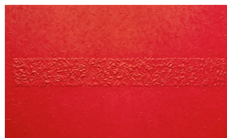
sem título, 2014 acrylic on canvas 150 x 250 cm