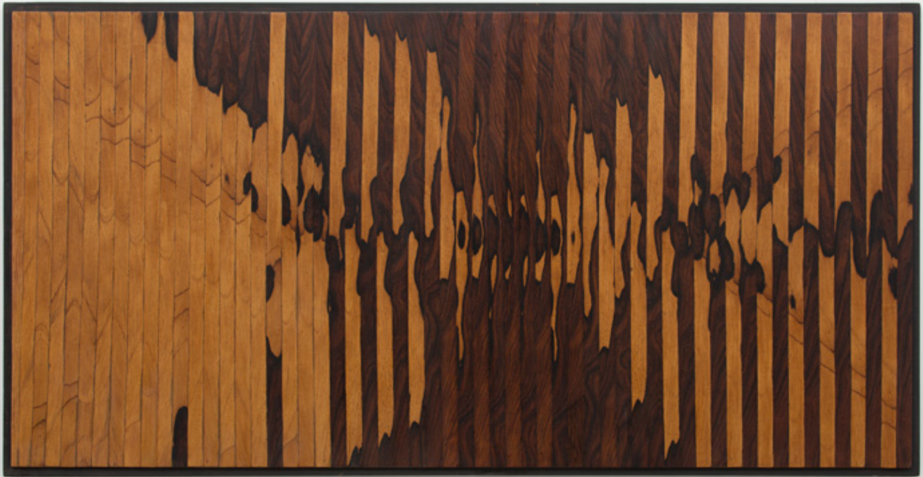
Progressão 202, 1965 -- jacarandá wood -- 68 x 133 cm