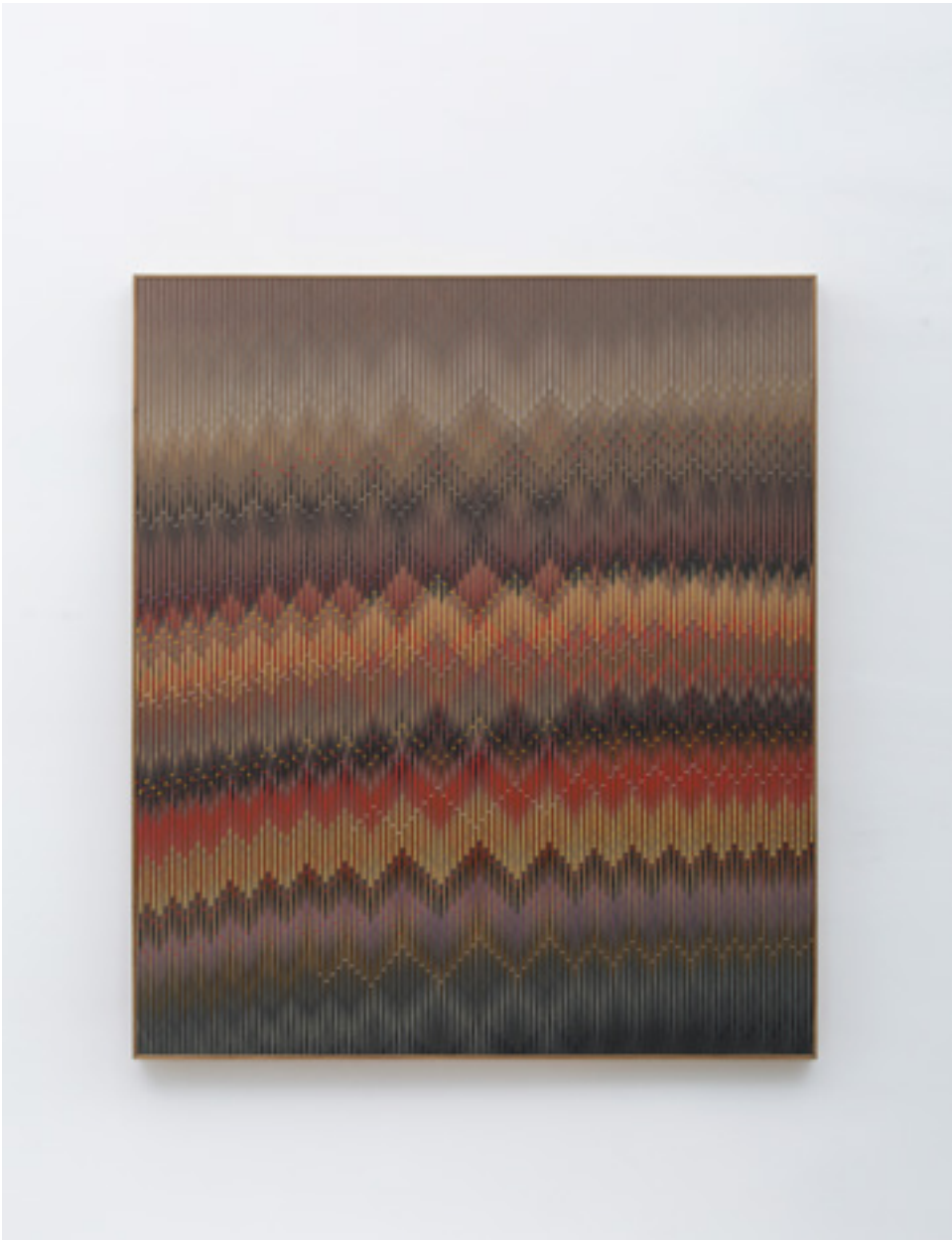
W-817 , 2015 -- acrylic on wood -- 125 x 110 x 5 cm W-810 , 2016 -- acrylic on wood -- 125 x 110 x 5 cm