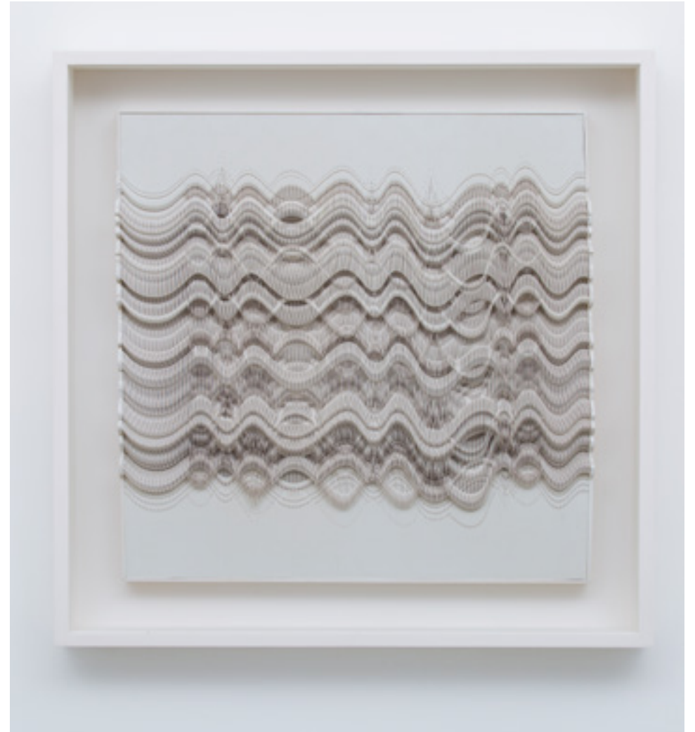
Untitled, 2002 -- duplex paperboard and wood -- 65 x 55 x 5 cm