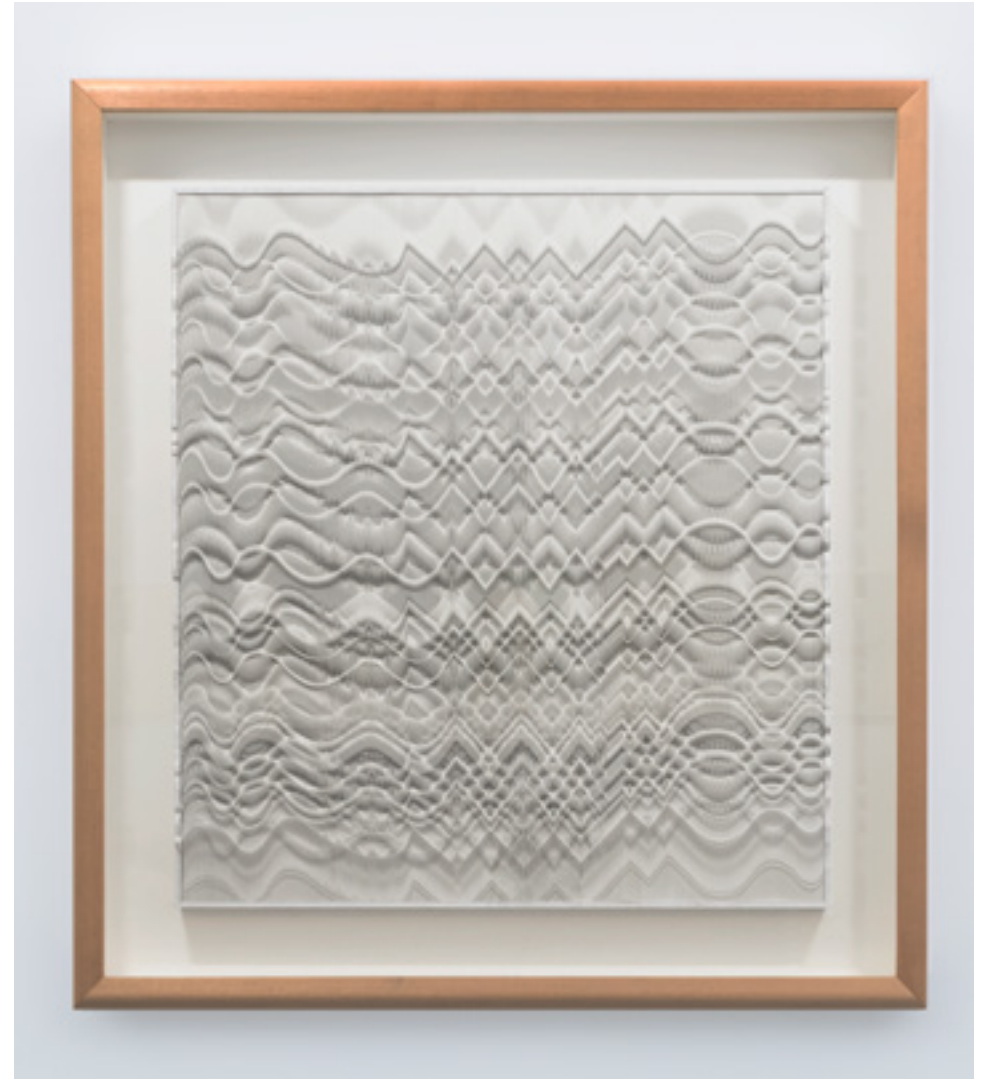
Untitled, 1995 -- duplex paperboard and wood -- 87,5 x 82 x 10 cm