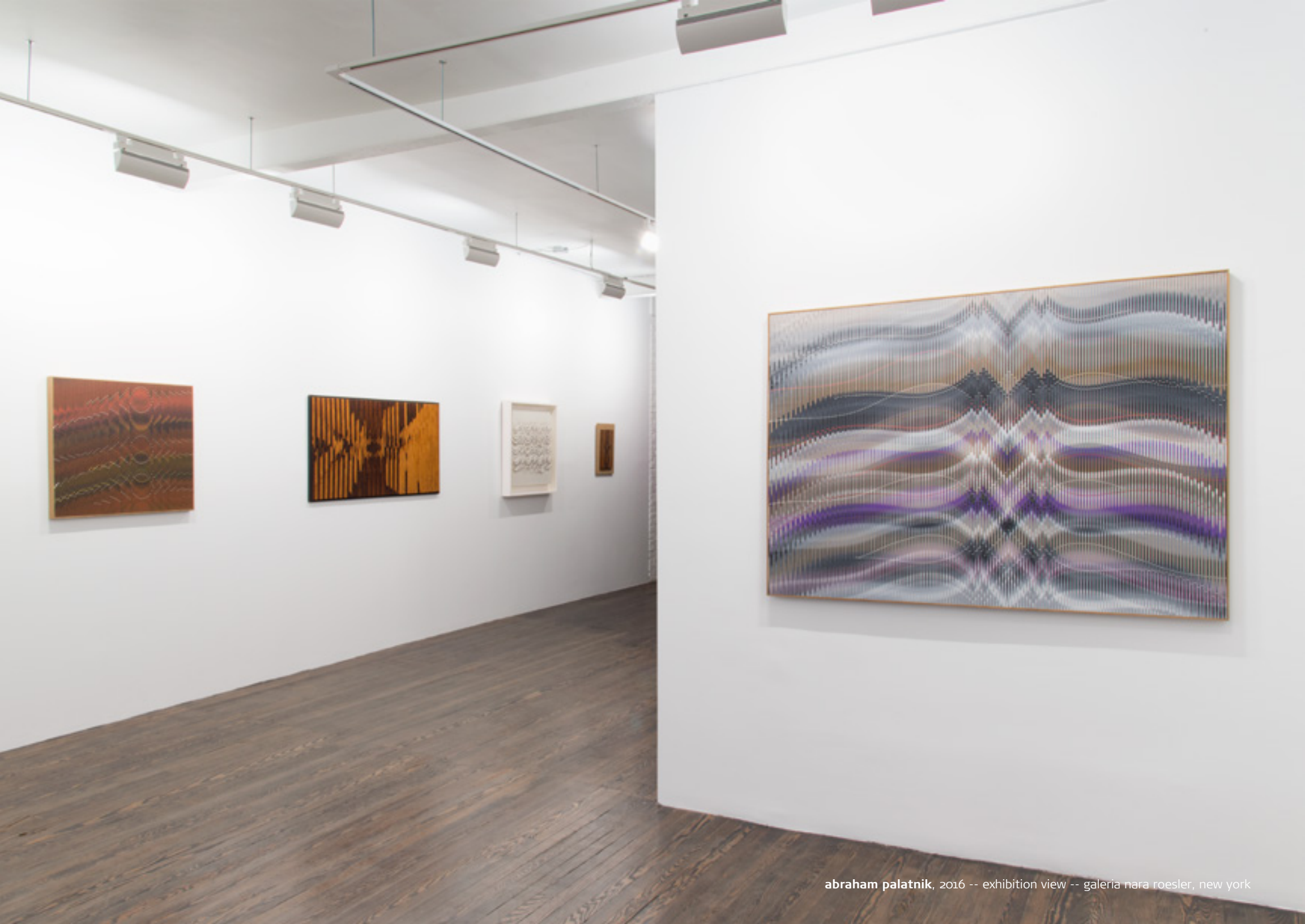
abraham palatnik, 2016 -- exhibition view -- galeria nara roesler, new york