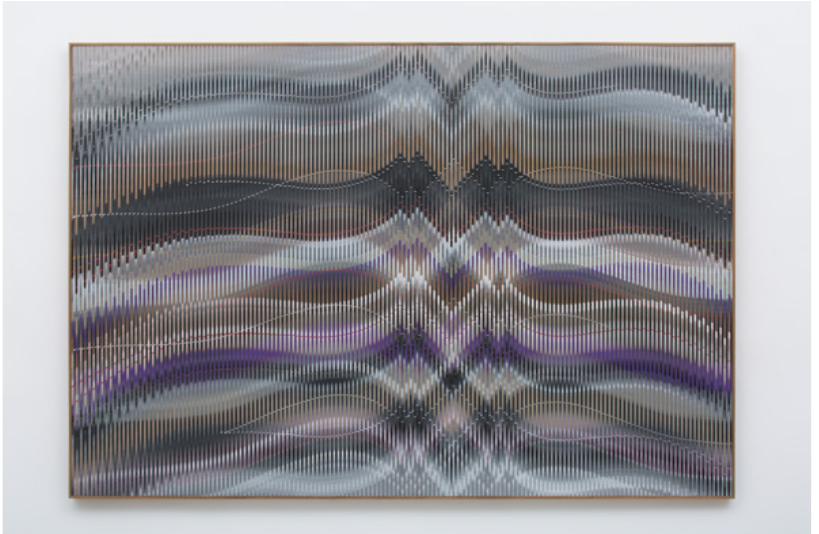
W-899, 2016 -- acrylic on wood -- 110 x 165 x 5 cm