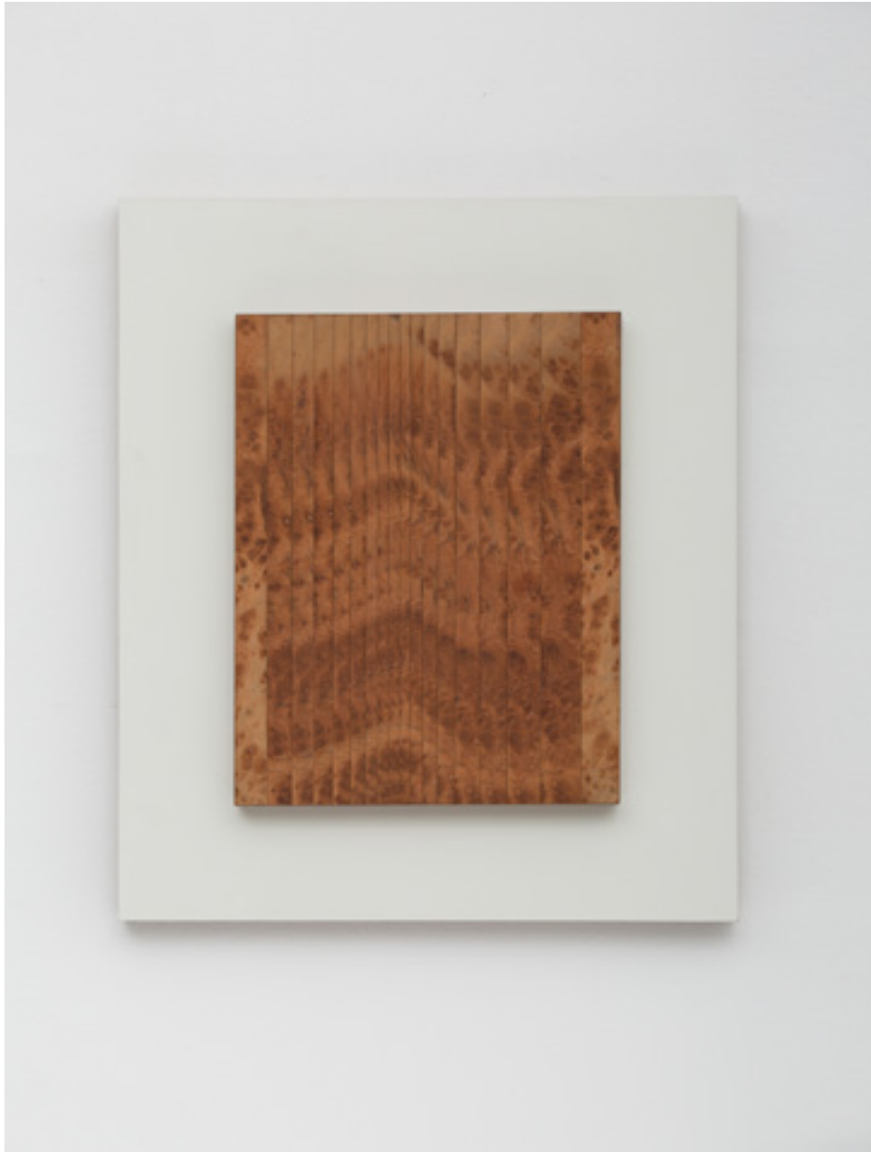
Untitled, 1970 -- jacarandá wood -- 41,2 x 32,3 cm Untitled, 1971 -- jacarandá wood -- 38,5 x 24 cm