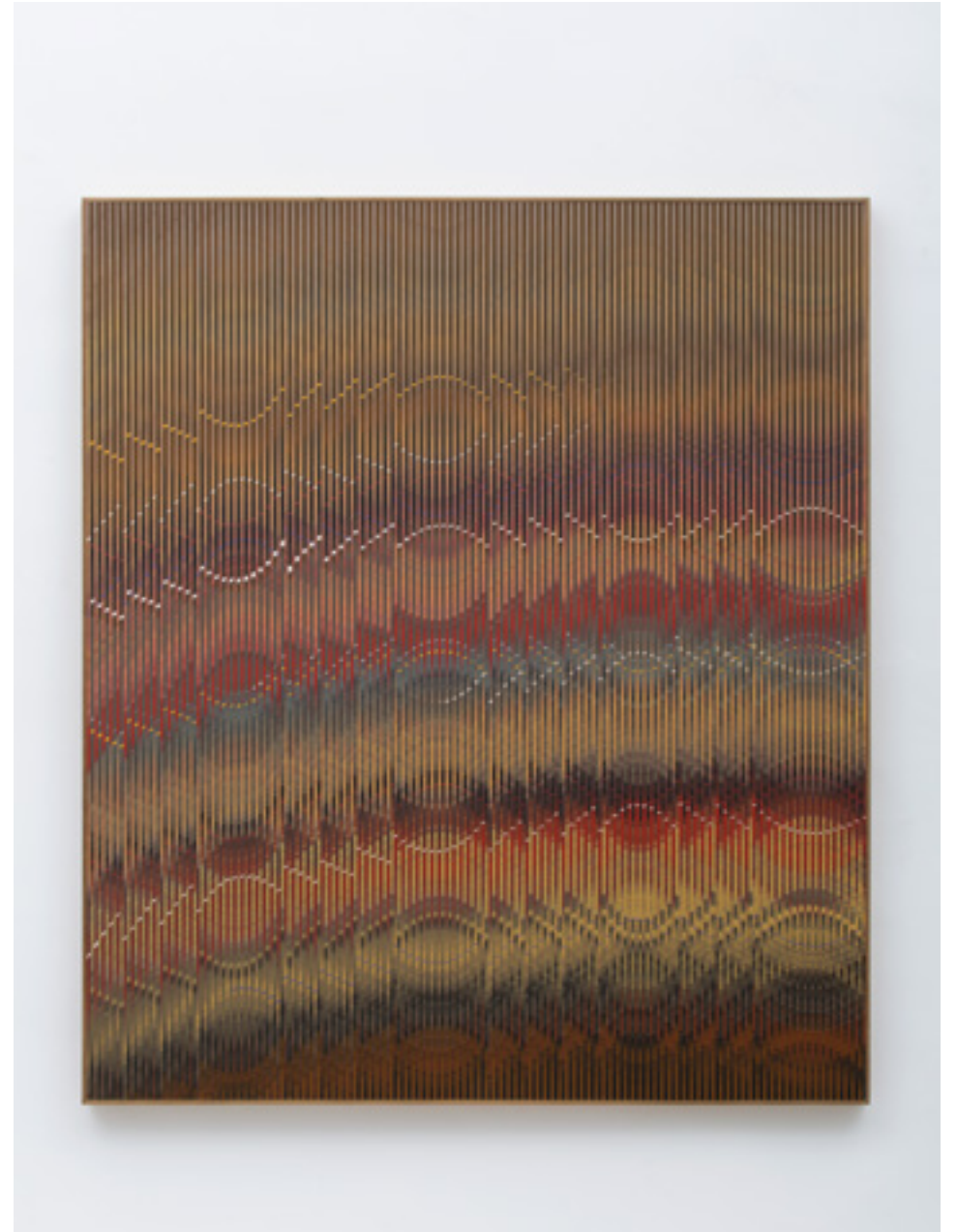
W-707 , 2015 -- acrylic on wood -- 125 x 110 x 5 cm