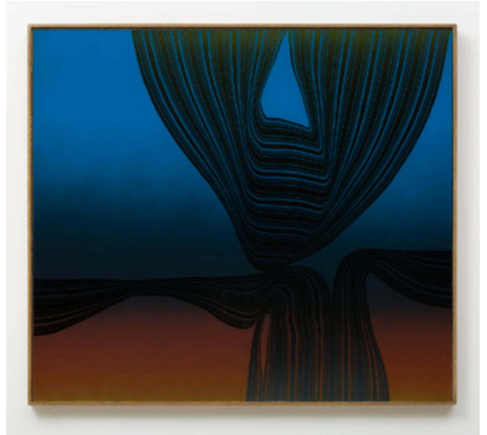
Untitled, 1960 -- friable ink on glass -- 86,5 x 98 cm