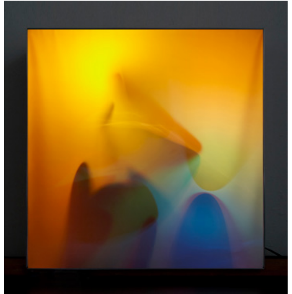
Aparelho Cinecromático , 1955 wood, metal, screws, plastic, light bulbs, synthetic fabric and electrical components 61.3 x 61 x 19.7 cm