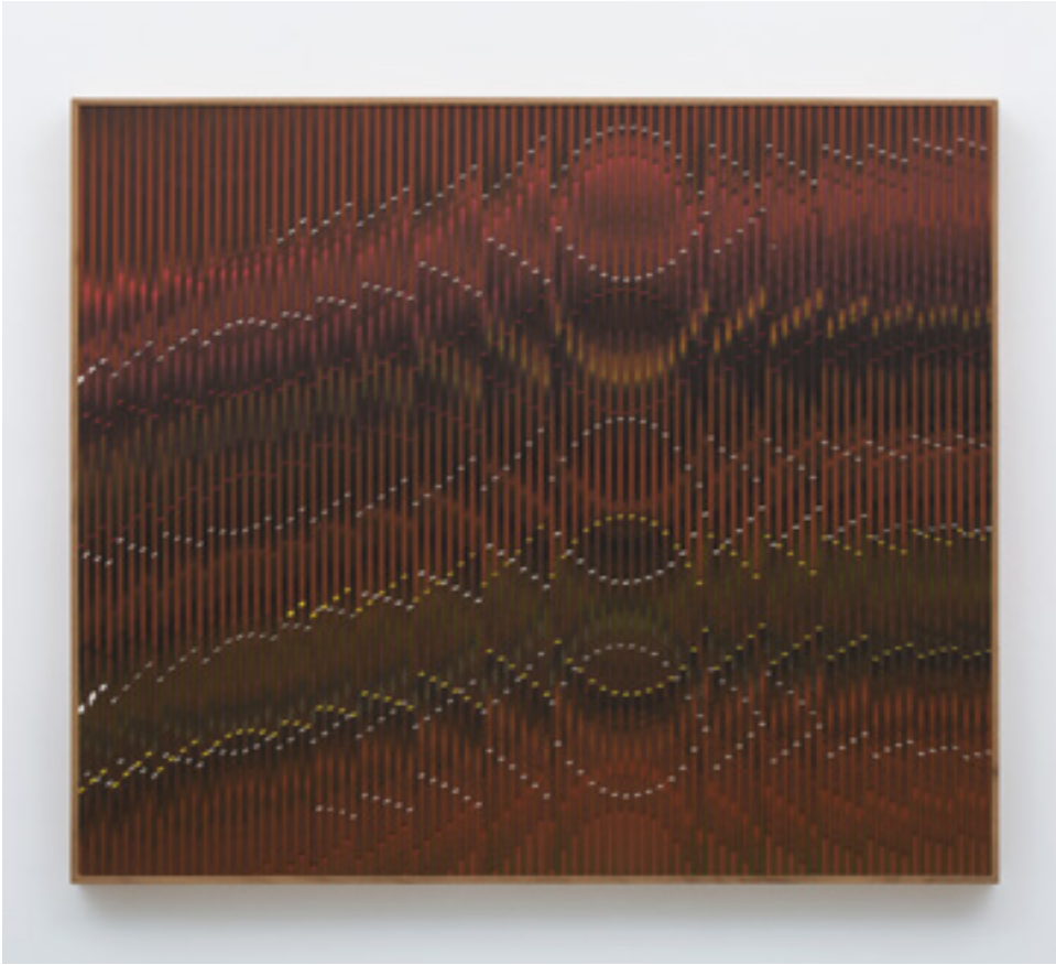
W-861 , 2016 -- acrylic on wood -- 70 x 80 x 5 cm