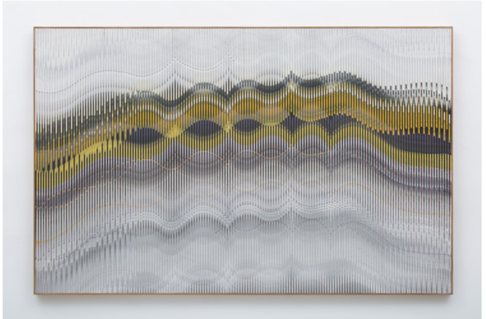
W-562, 2014 -- acrylic on wood -- 110 x 165 x 5 cm