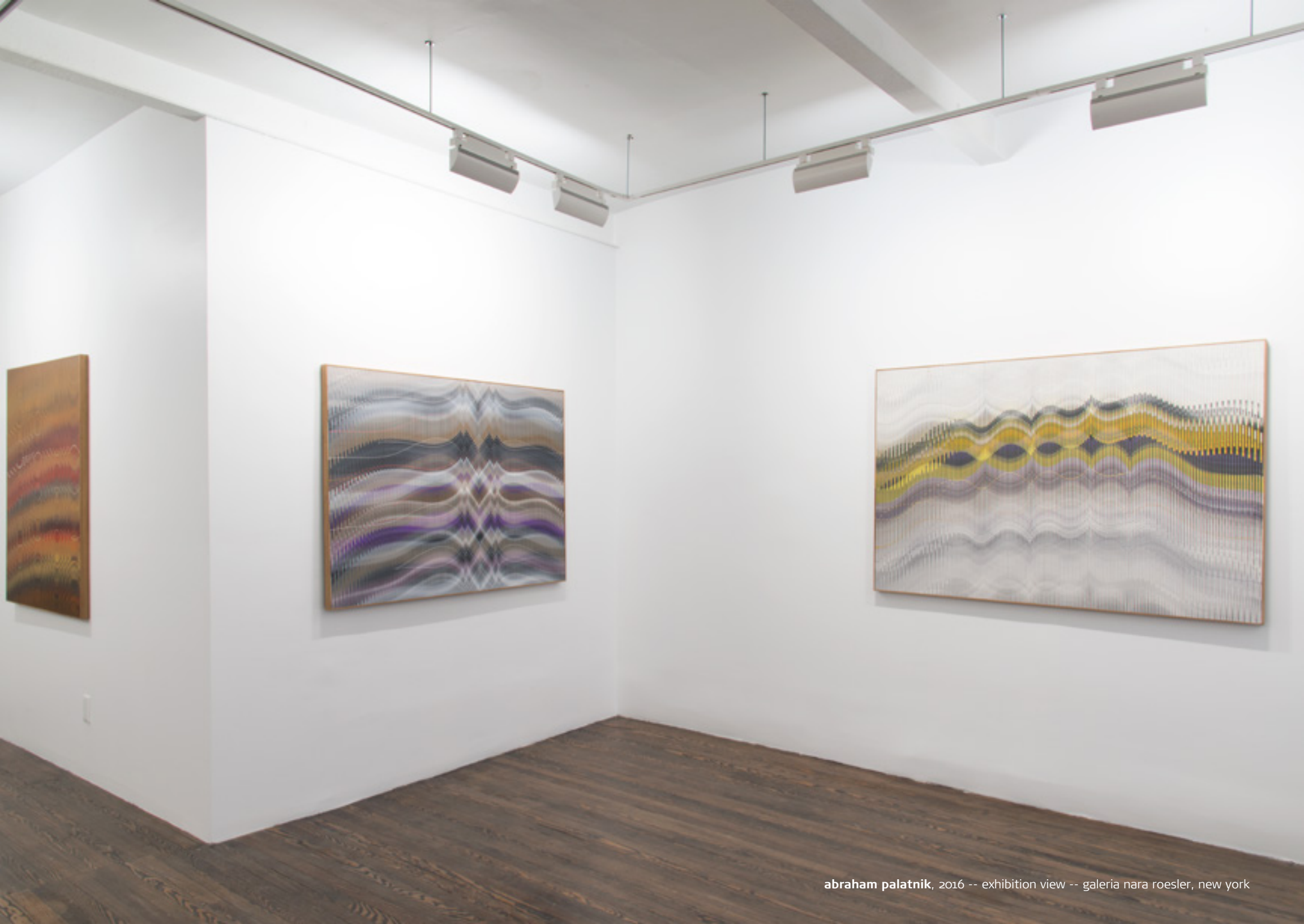
abraham palatnik, 2016 -- exhibition view -- galeria nara roesler, new york