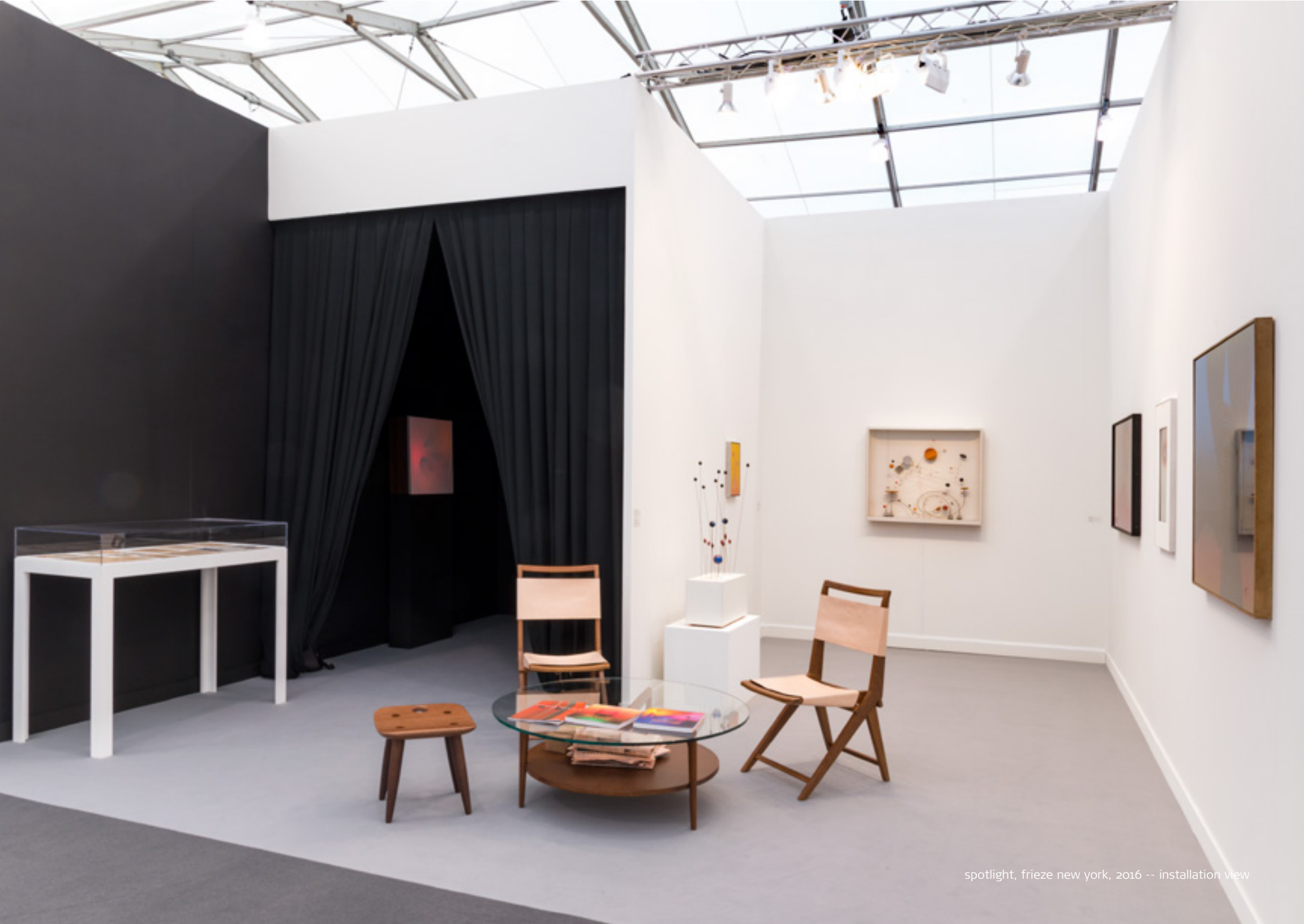
spotlight, frieze new york, 2016 -- installation view