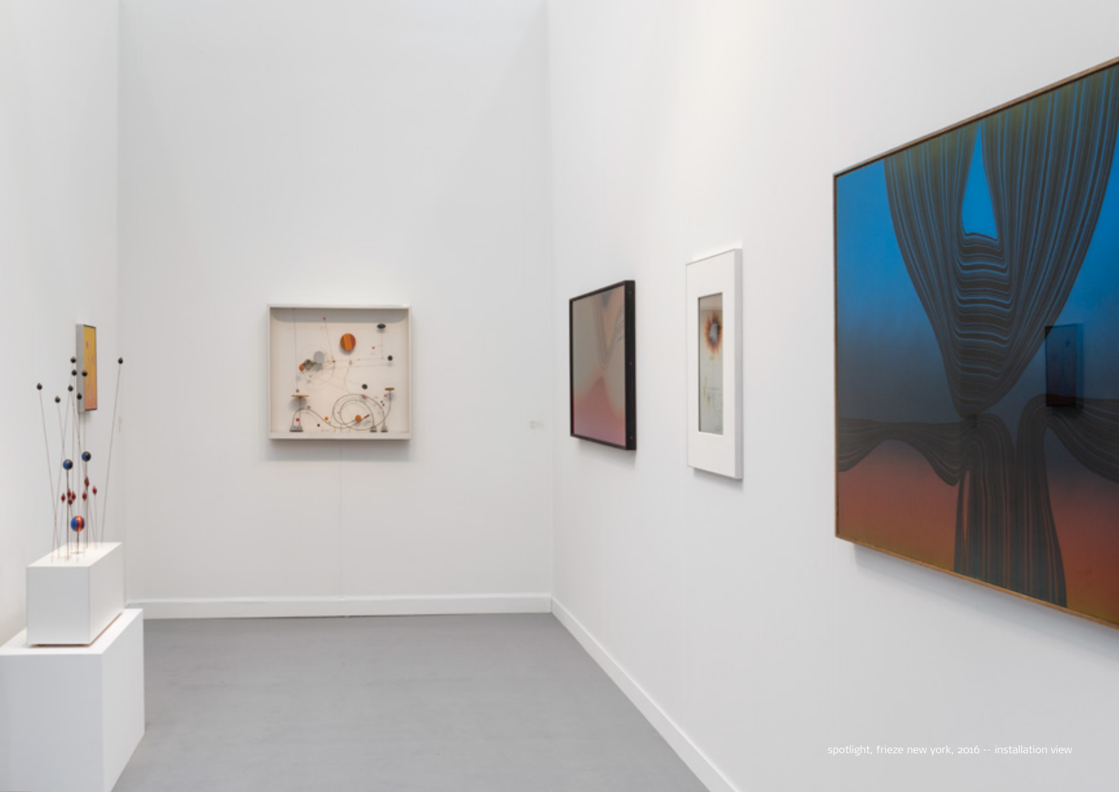
spotlight, frieze new york, 2016 -- installation view