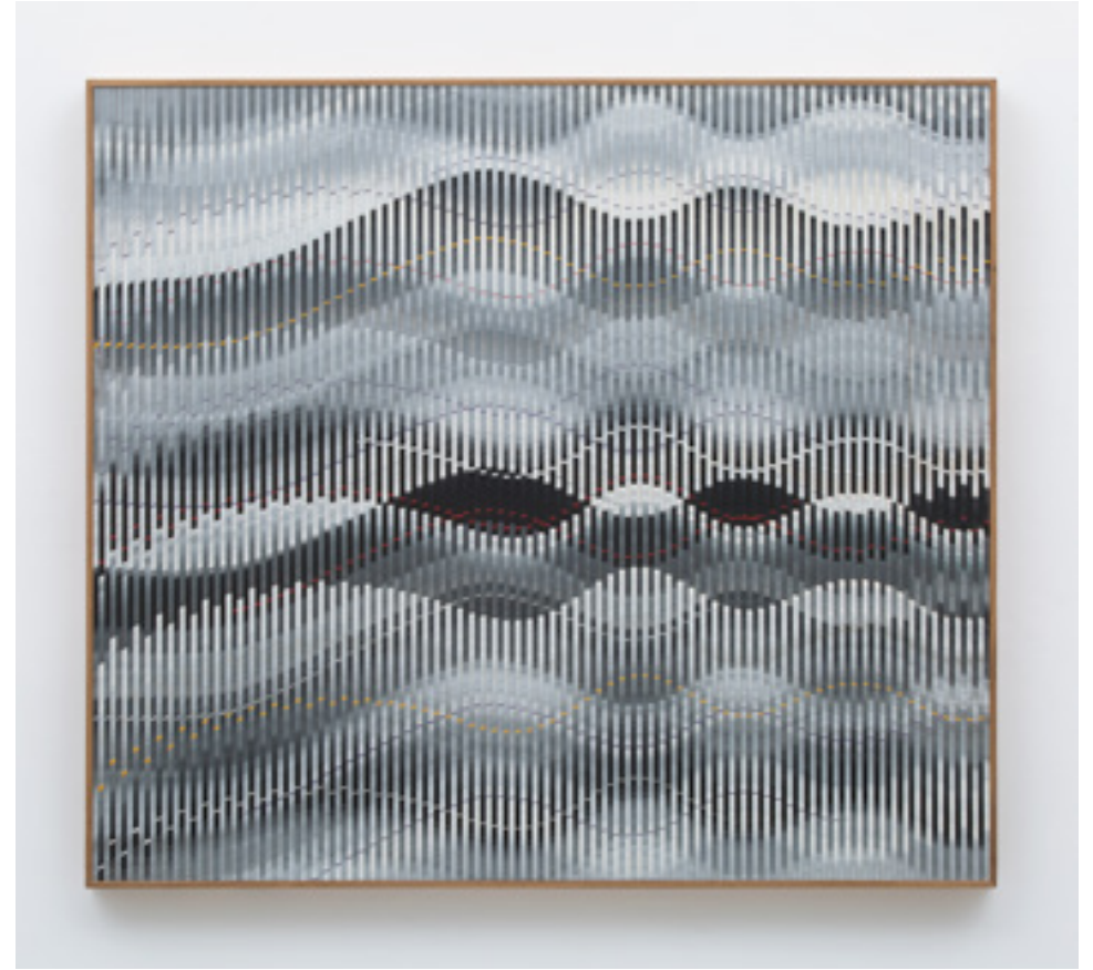
W-725 , 2015 -- acrylic on wood -- 70 x 80 x 5 cm