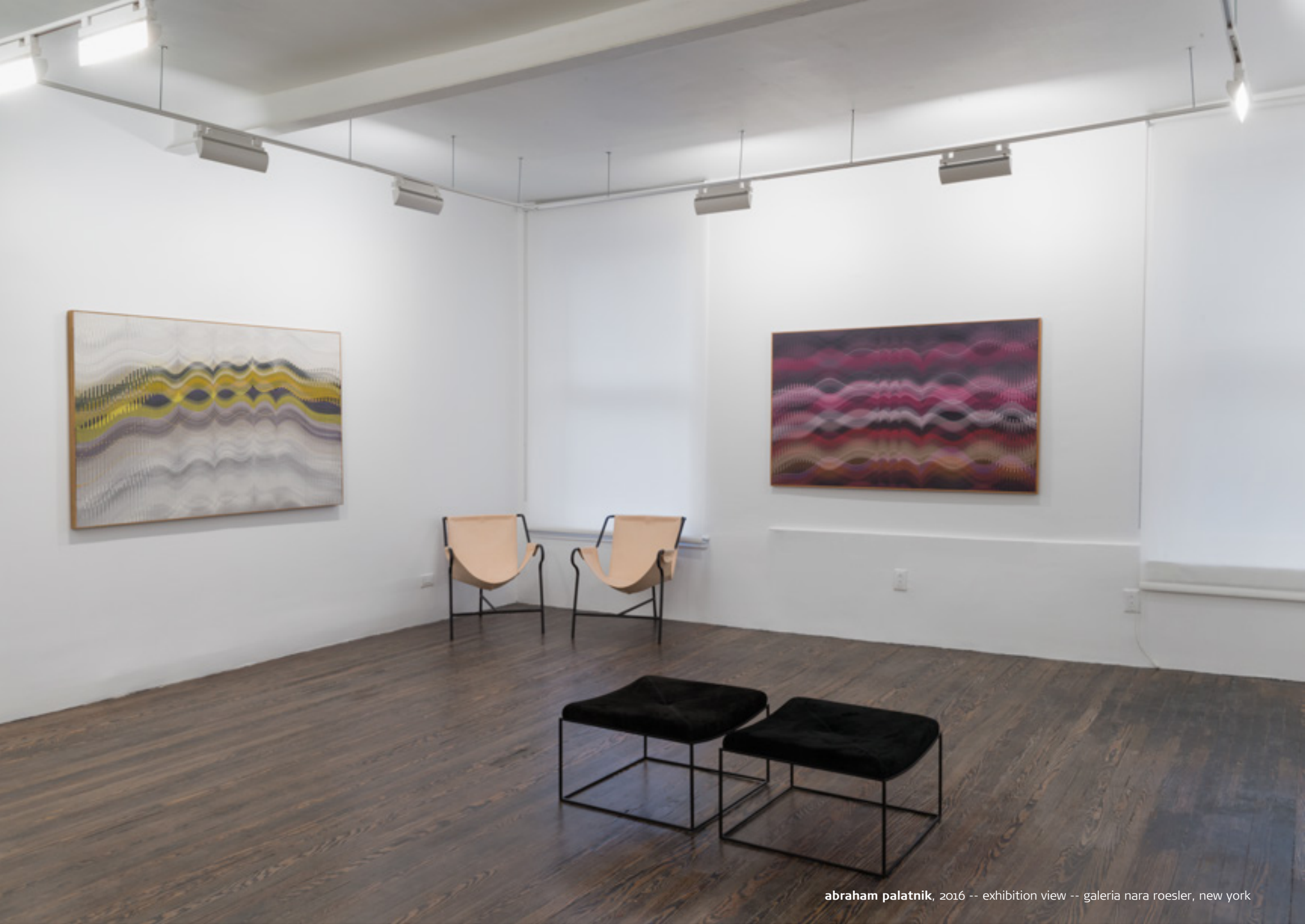
abraham palatnik, 2016 -- exhibition view -- galeria nara roesler, new york