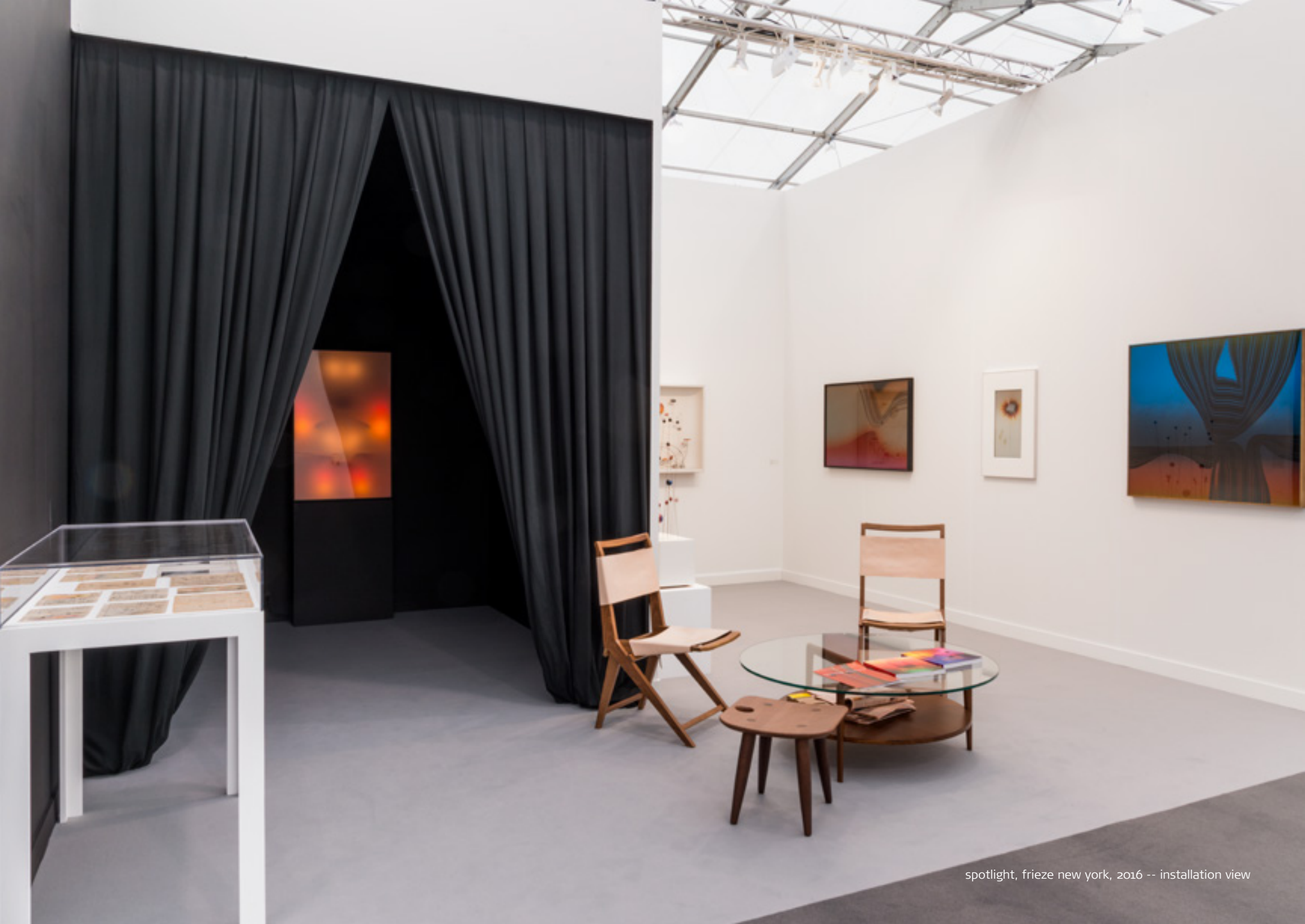
spotlight, frieze new york, 2016 -- installation view