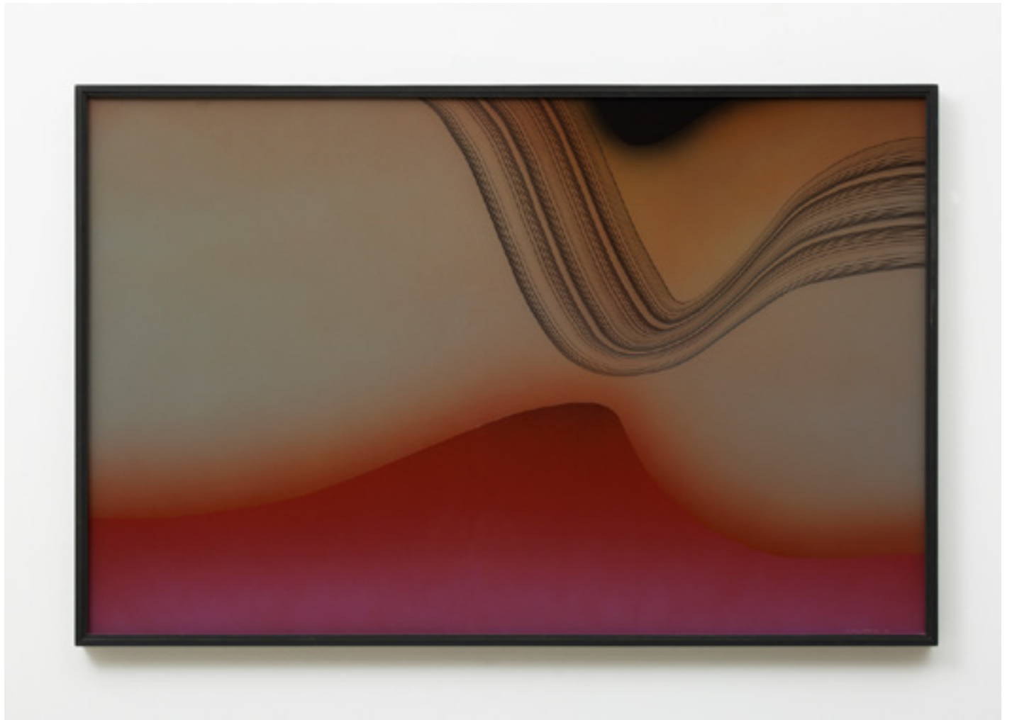
Untitled, 1960 -- friable ink on glass -- 70 x 108 cm