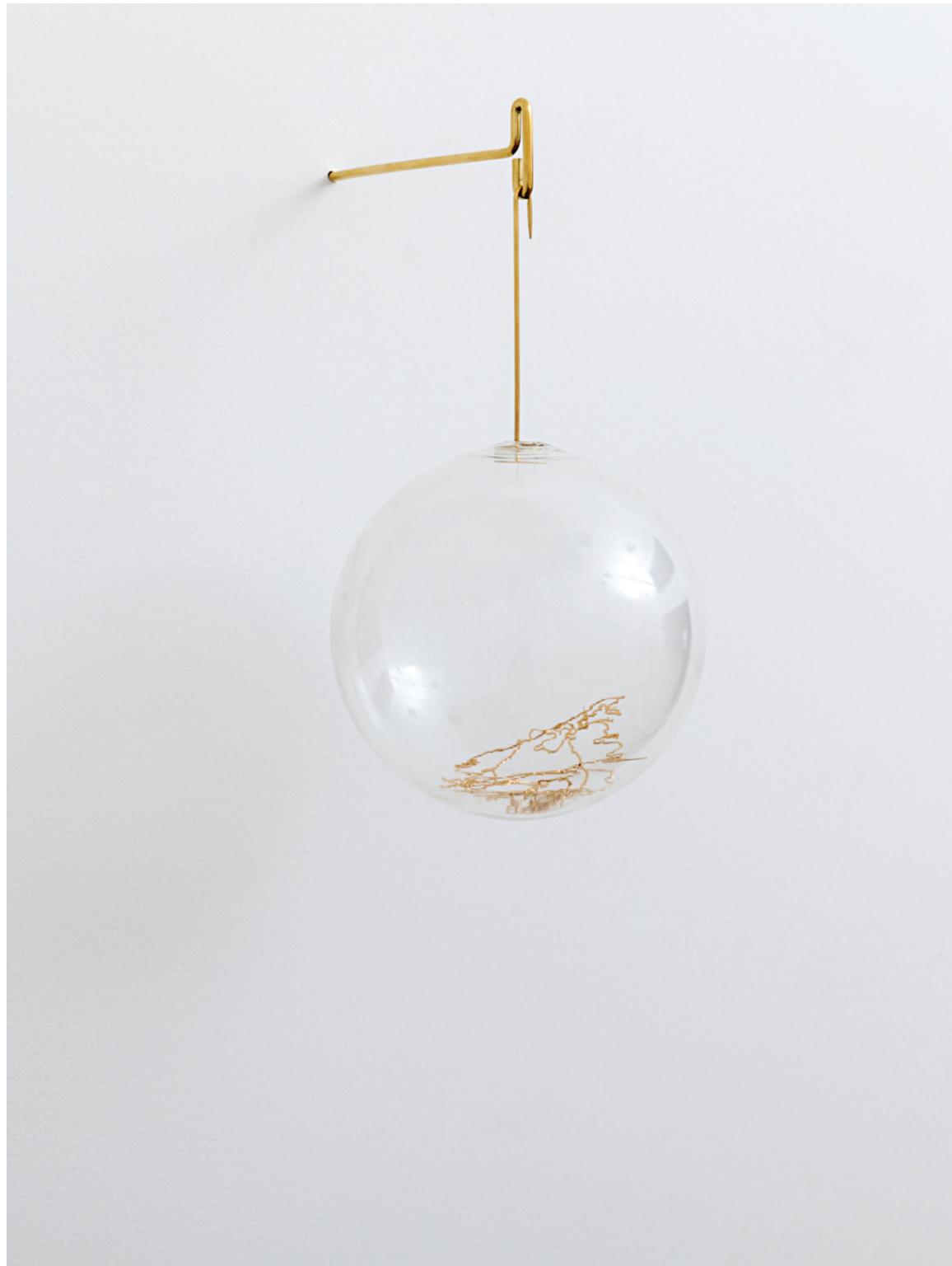
Morro Mundo Mundo # 1 [Hill World World # 1], 2018 borosilicate glass, gold-plated brass ø 6,7 x 7,9 in ø 16,9 x 20 cm