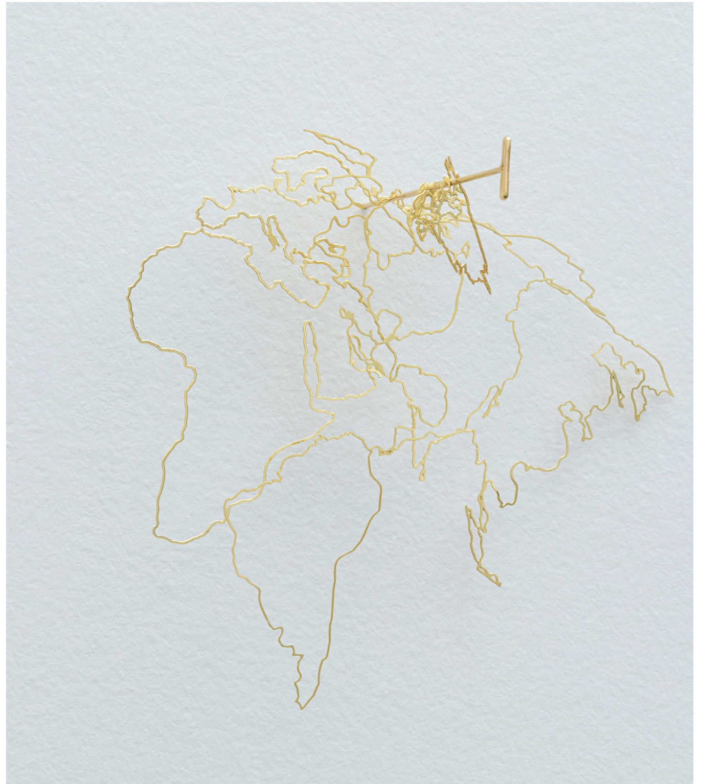
Morro Mundo Pin [Hill World Pin] , 2018 brass plated in gold variable dimensions