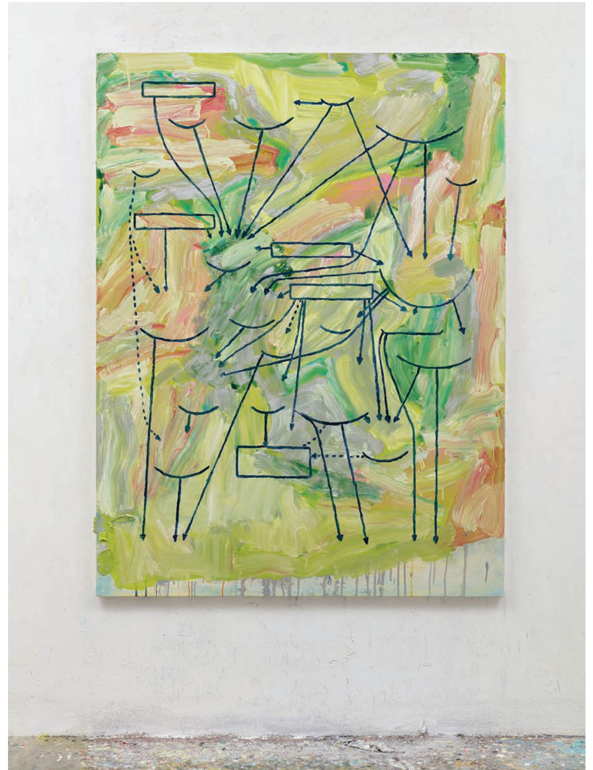
Contrato II , 2018 oil and aluminum paste on canvas 63 x 47.2 in