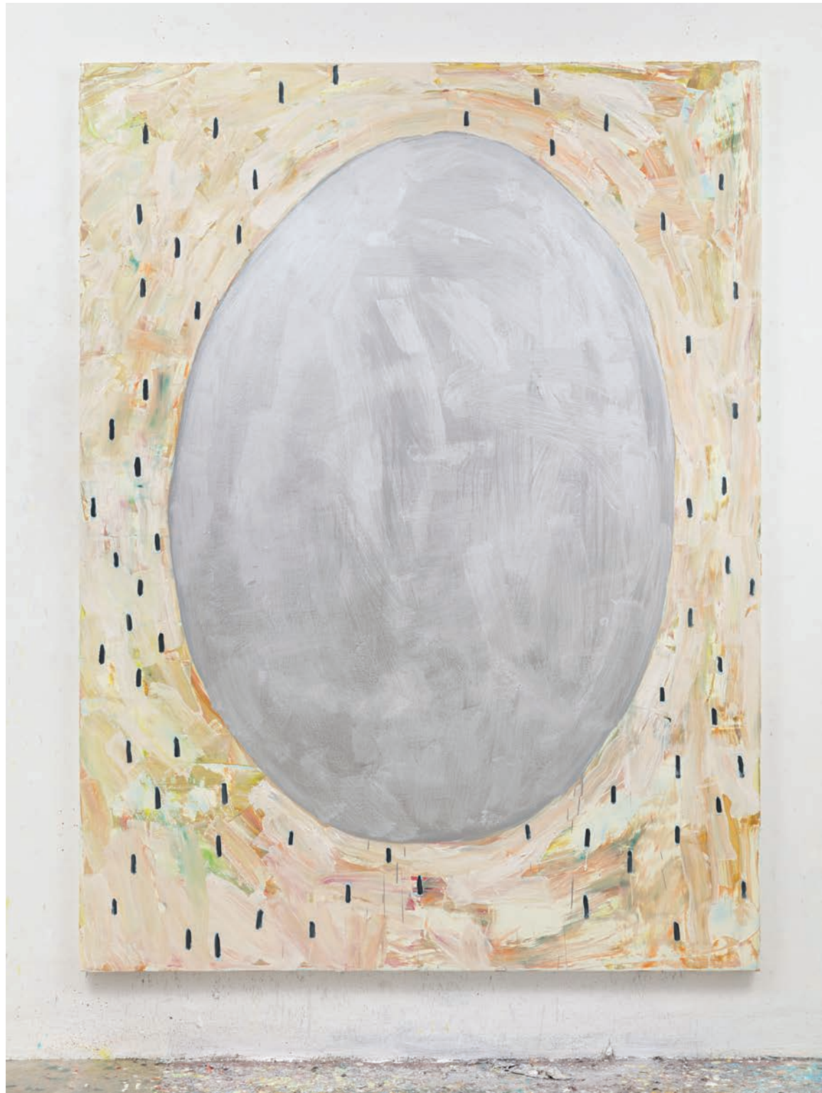
Espelho VI , 2018 oil and aluminum paste on canvas 78.7 x 59.1 in