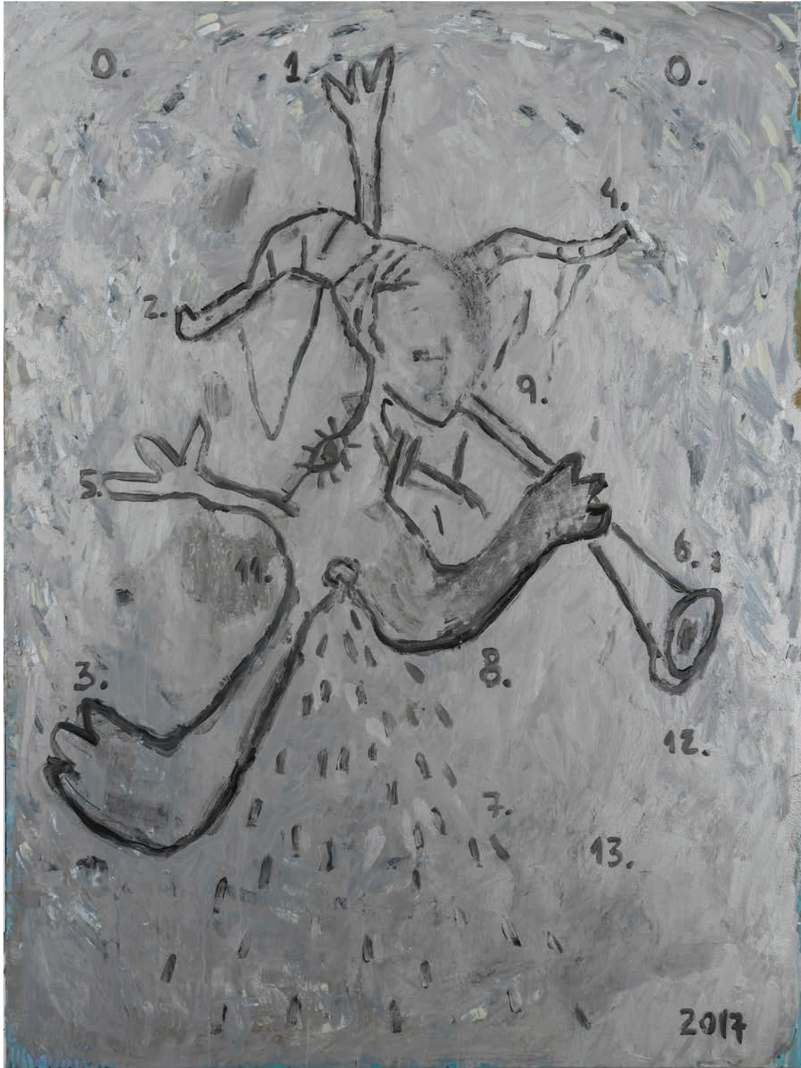
Pícaro , from the Bestiário series, 2017 oil and aluminum paste on canvas 63 x 47.2 in