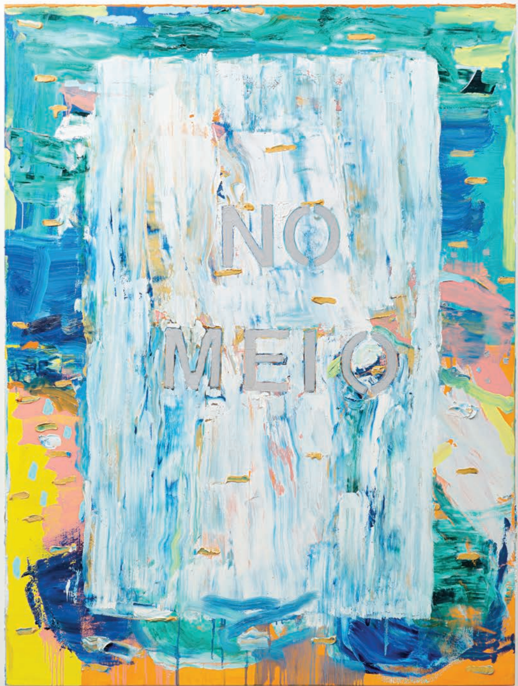
No Meio [In the Middle] , 2016 oil on canvas 63 x 47.2 in