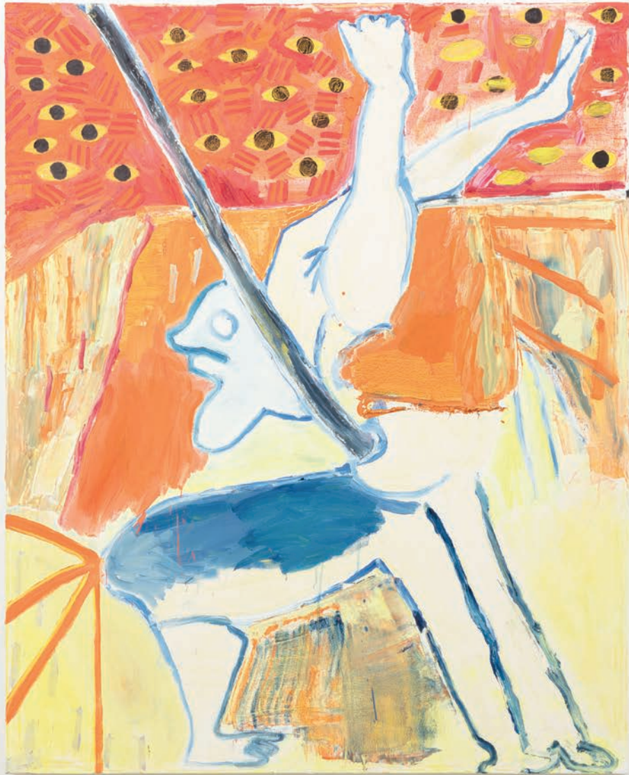
Grande Pacto, from the Bestiário series, 2017 oil on canvas 63 x 51.2 in