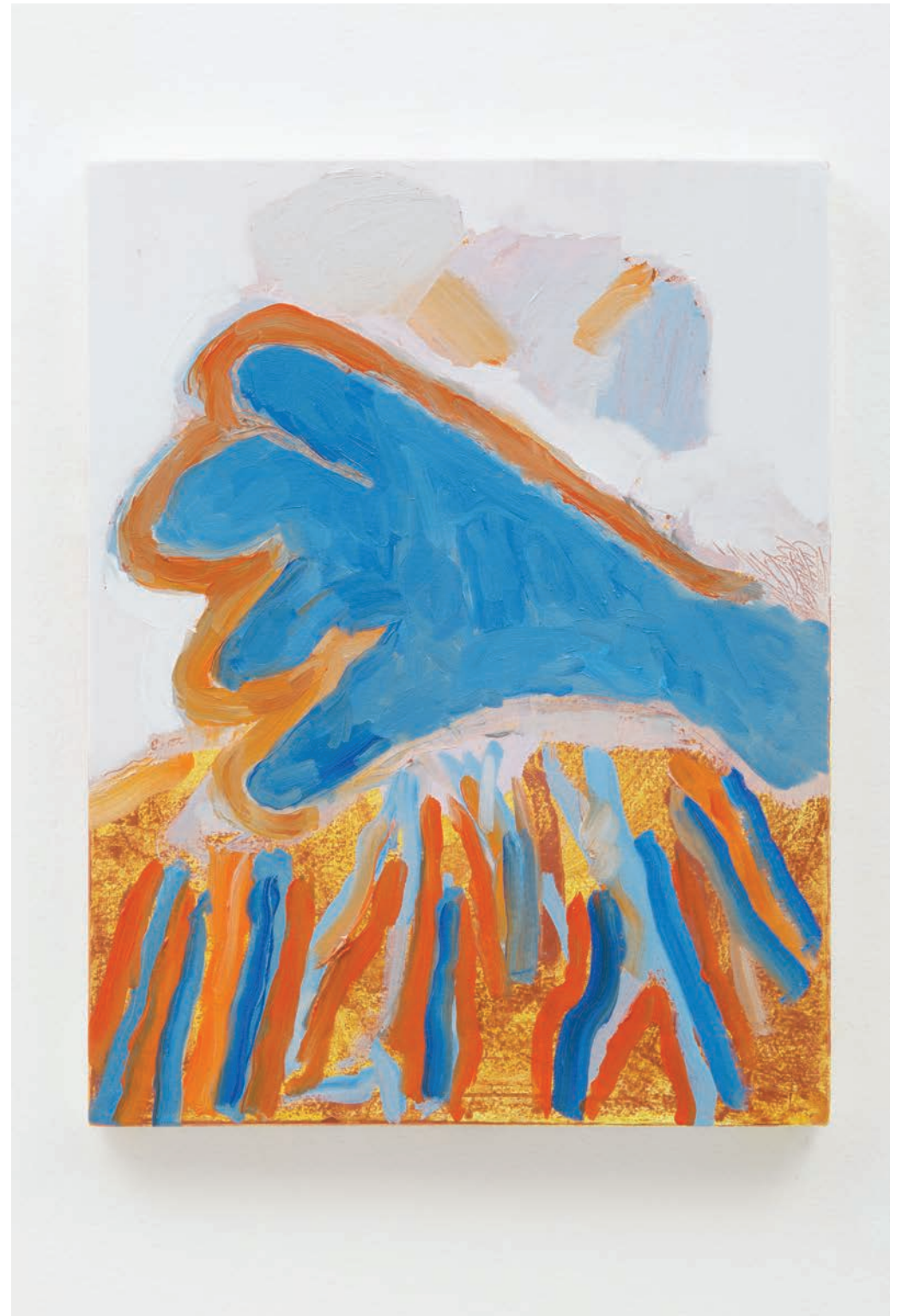
Untitled , 2015 oil on canvas 13.8 x 10.6 in