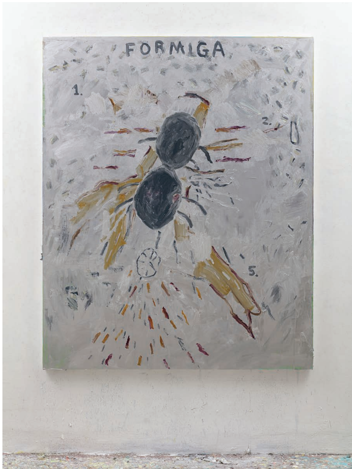
Formiga , 2018 oil on canvas 63 x 47.2 in