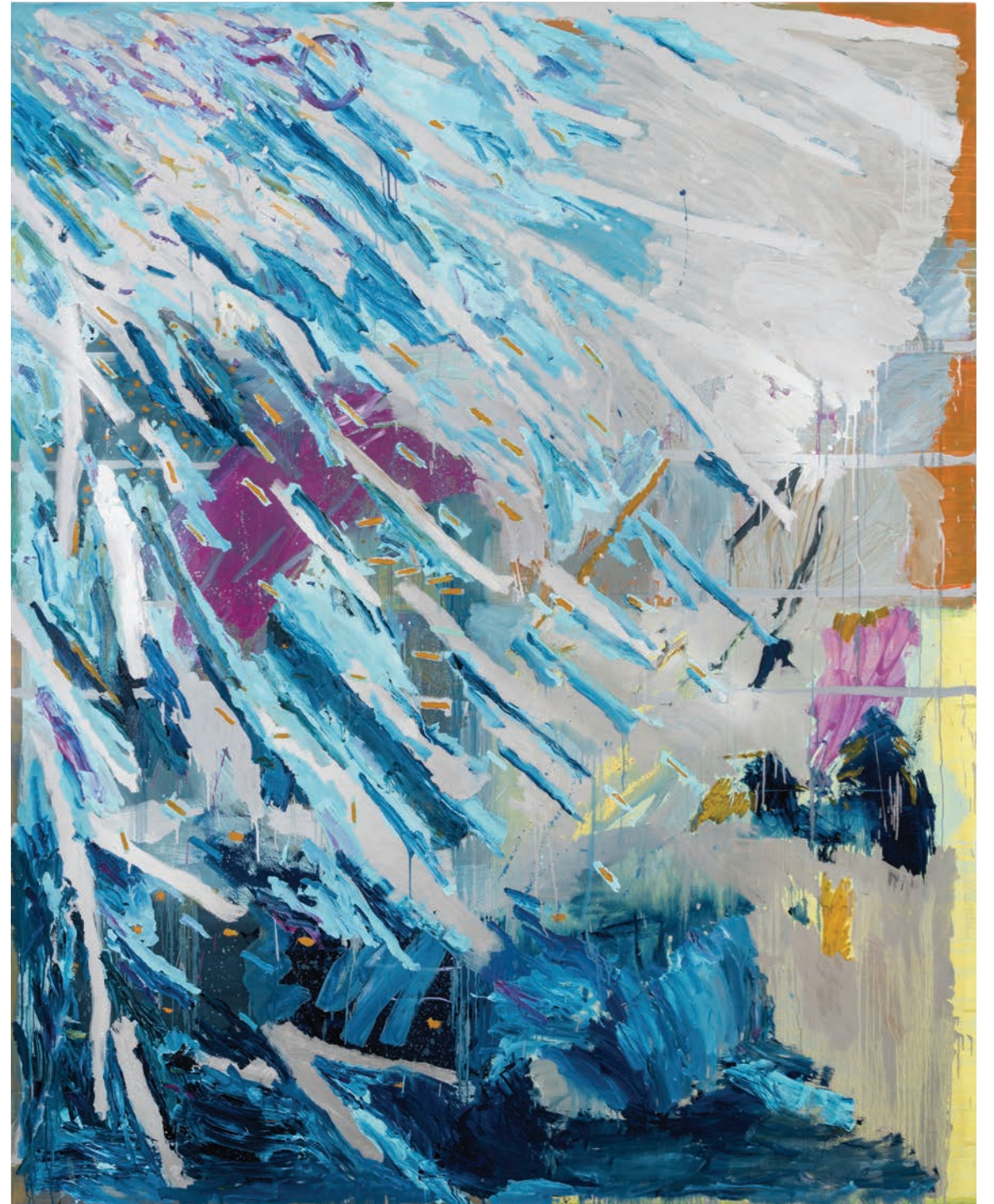
Diluvio, from the Bestiário series, 2018 oil and aluminum paste on canvas 98.4 x 78.7 in