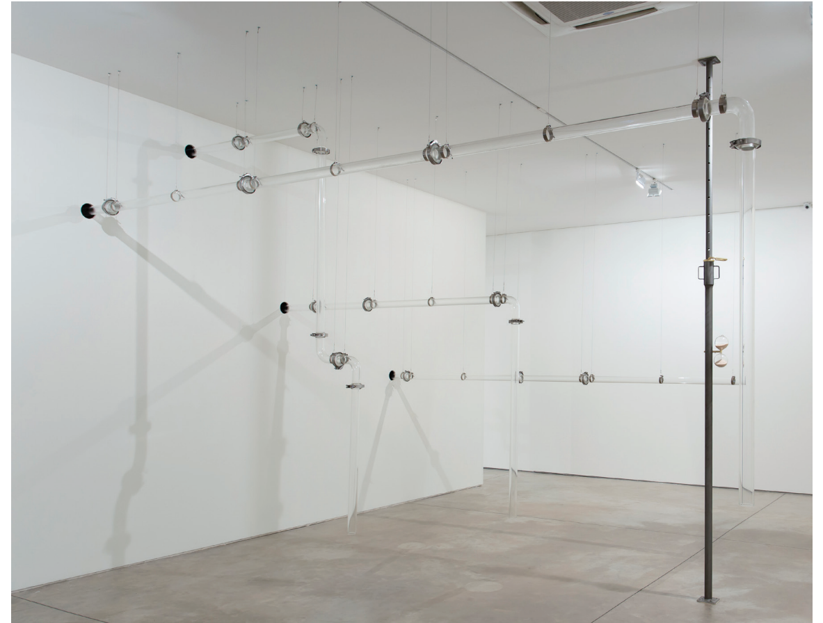
Morro Mundo , 2017 glass tube and smoke screen machine variable dimensions

Galeria Nara Roesler in Rio de Janeiro will be fully occupied by Laura Vinci's installation Morro Mundo , with a smooth white smoke that will invite the visitor to experience spatial disorientation and body reorientation. Her machine programmed to release smoke as its presence sensors are activated reveals itself to the spectator by its glass pipes that cross the whole exhibition area. In this installation, the vapor is announced before it is released in the air. This way, the pipes not only announce the experience, but are also windows through which the eye can catch the smoke in a controlled situation. After it is released, the smoke dominates the space, turning the pipeline almost invisible to those who observe the scene at the same time they are engulfed by the fog.