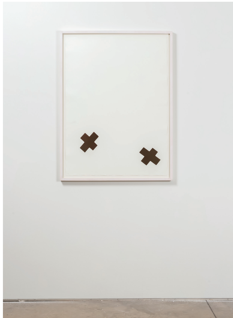
X vermelho , 2017 etching on hahnemuhle 100% cotton paper ed 1/5 + 1 PA 125 x 80 cm