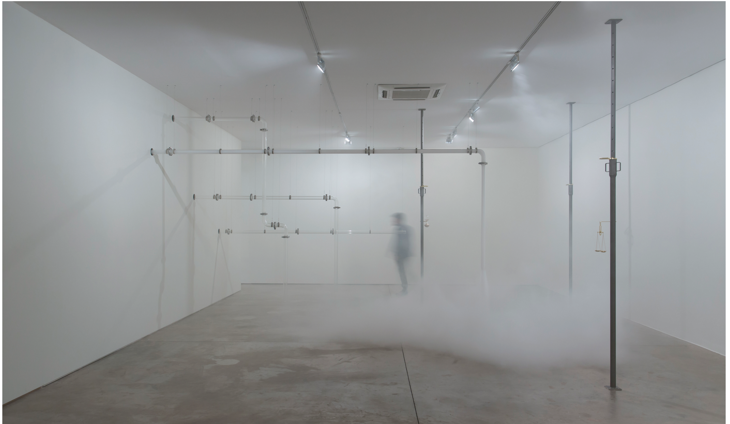
Morro Mundo , 2017 glass tube and smoke screen machine variable dimensions