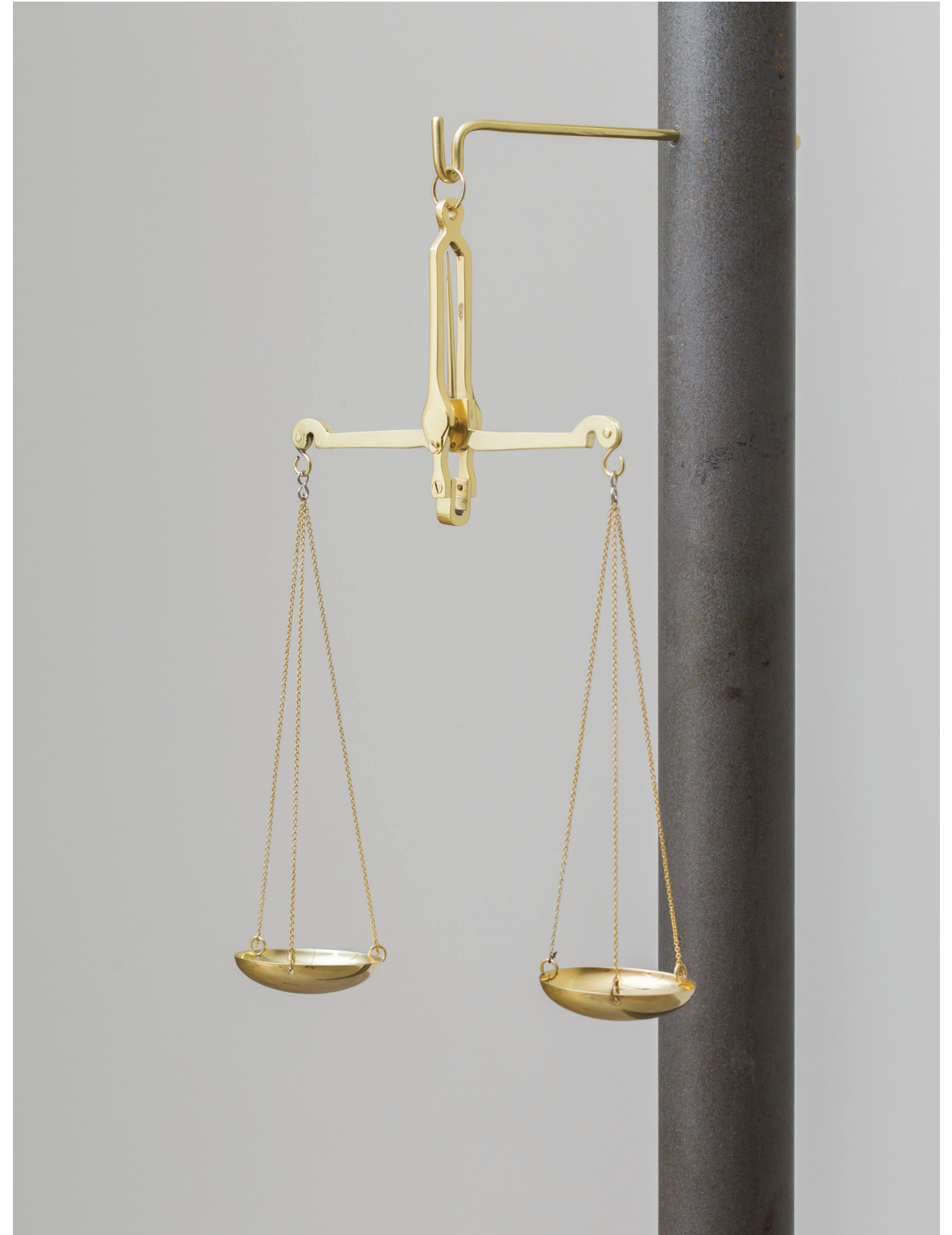
Duas Medidas , 2017 gold-plated brass and grenade shrapnel ed PA