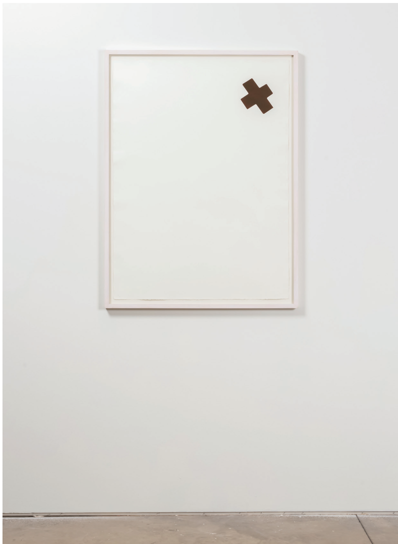
X vermelho , 2017 etching on hahnemuhle 100% cotton paper ed 1/5 + 1 PA 125 x 80 cm