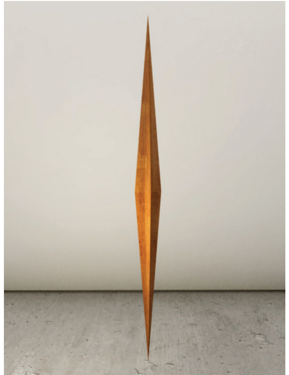
Artur Lescher Quatro , 2018 cabreúva wood 78.7 x 4.7 x 4.7 in