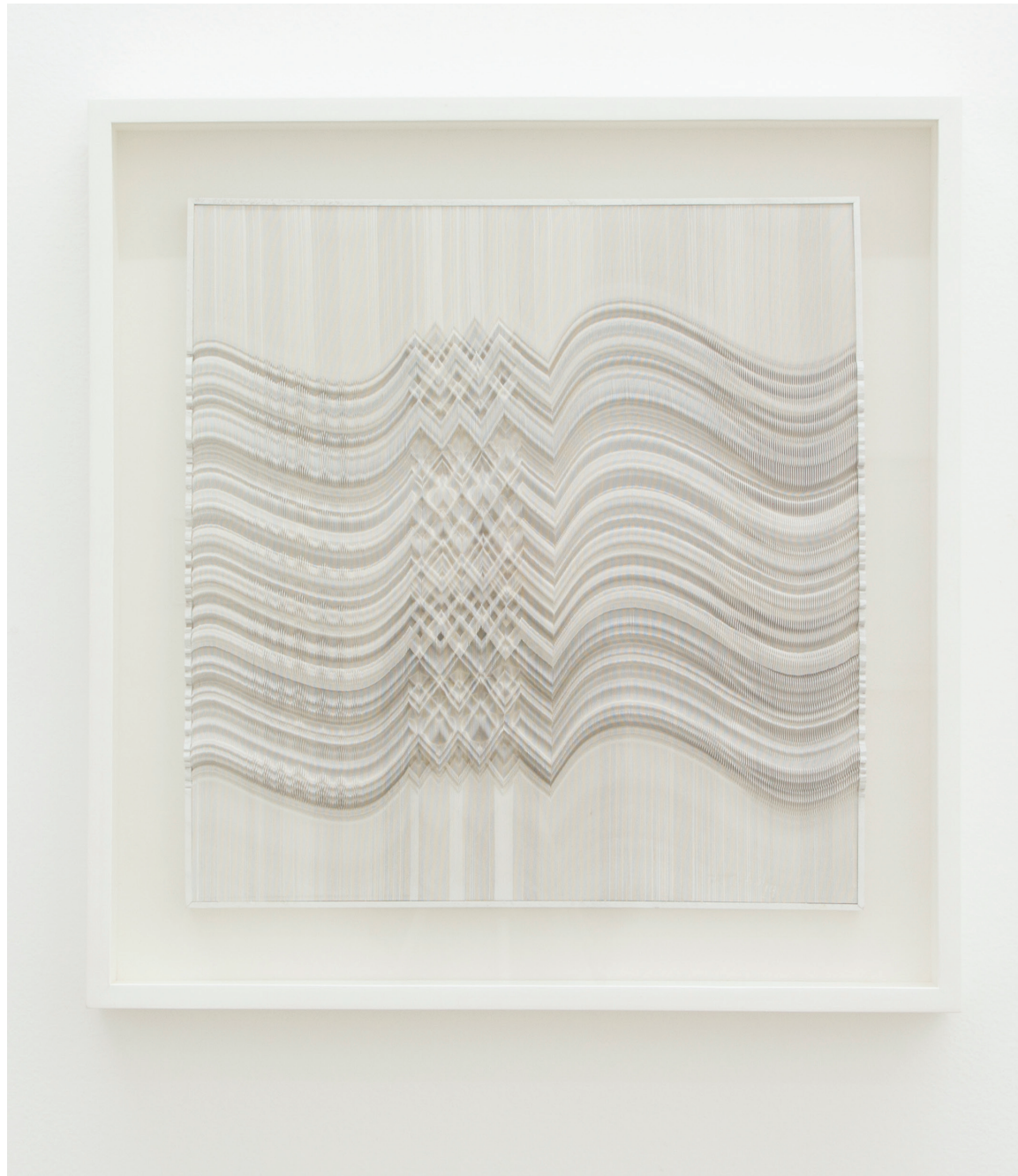
Abraham Palatnik Untitled , 2014 duplex paperboard and wood 32.7 x 29.9 in