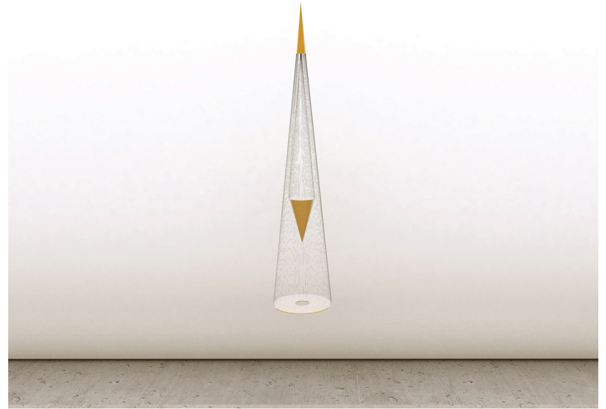
Artur Lescher Arturo , 2018 brass and multi-filament line 70.9 x 9.6 x 9.6 in