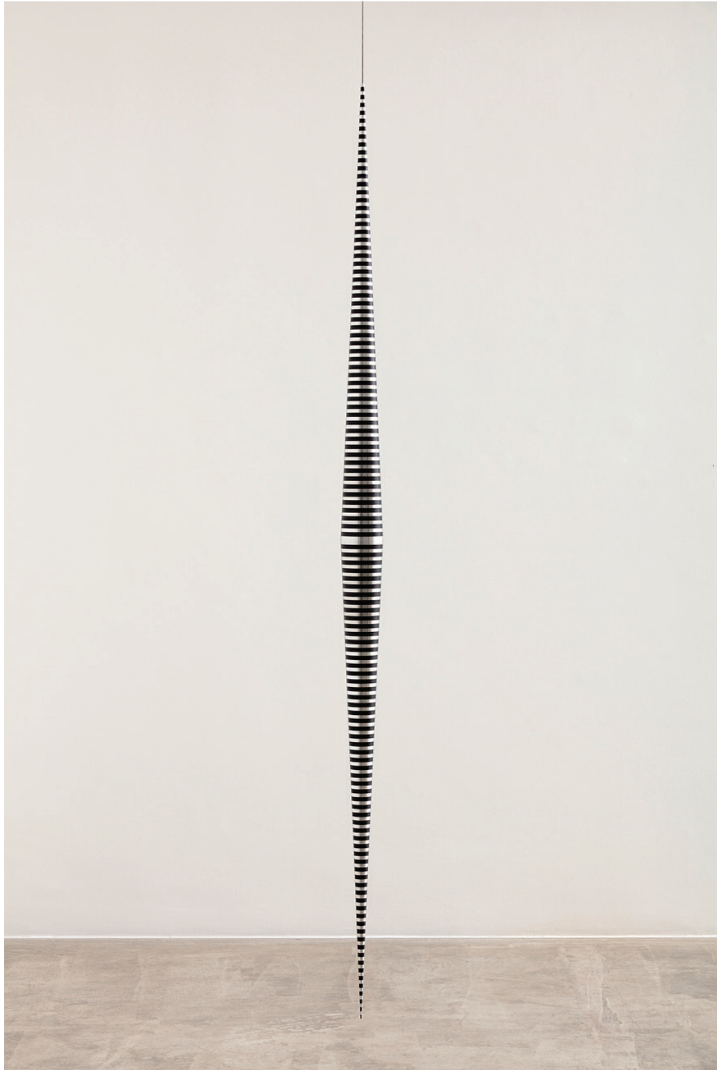
Artur Lescher Itze , 2017 brass and steel cable 86.6 x 4.7 in