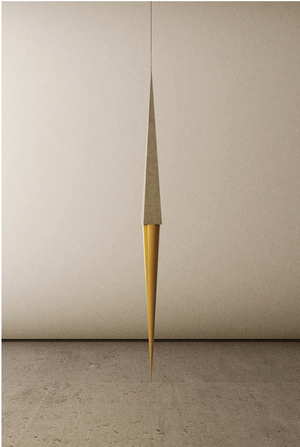
Artur Lescher Lilla #3 , 2018 brass 86.6 x 4.7 x 4.7 in