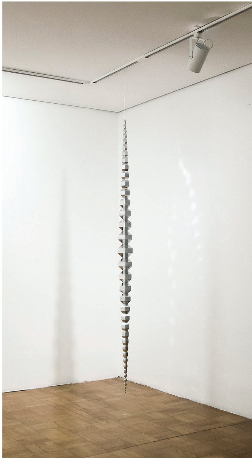
Artur Lescher Untitled (diamantado) , 2015 aluminum 86.6 x ø 4.87 in