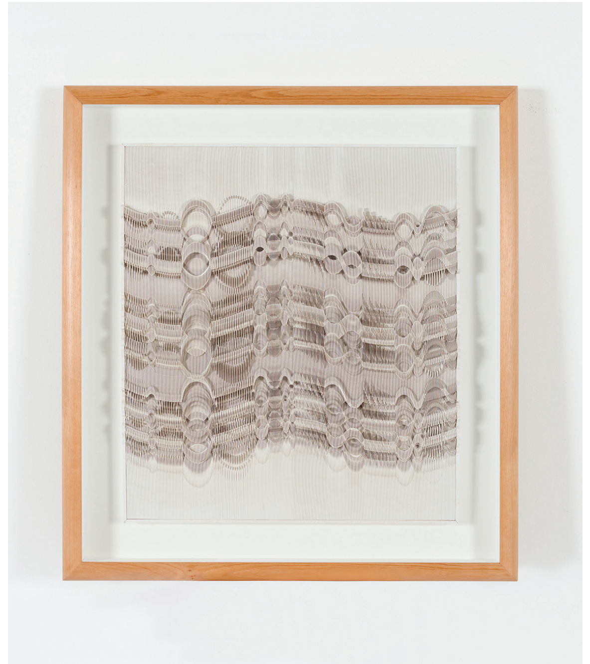
Abraham Palatink Untitled , 1982 progressive relief on duplex paperboard and wood 32.7 x 29.9 in