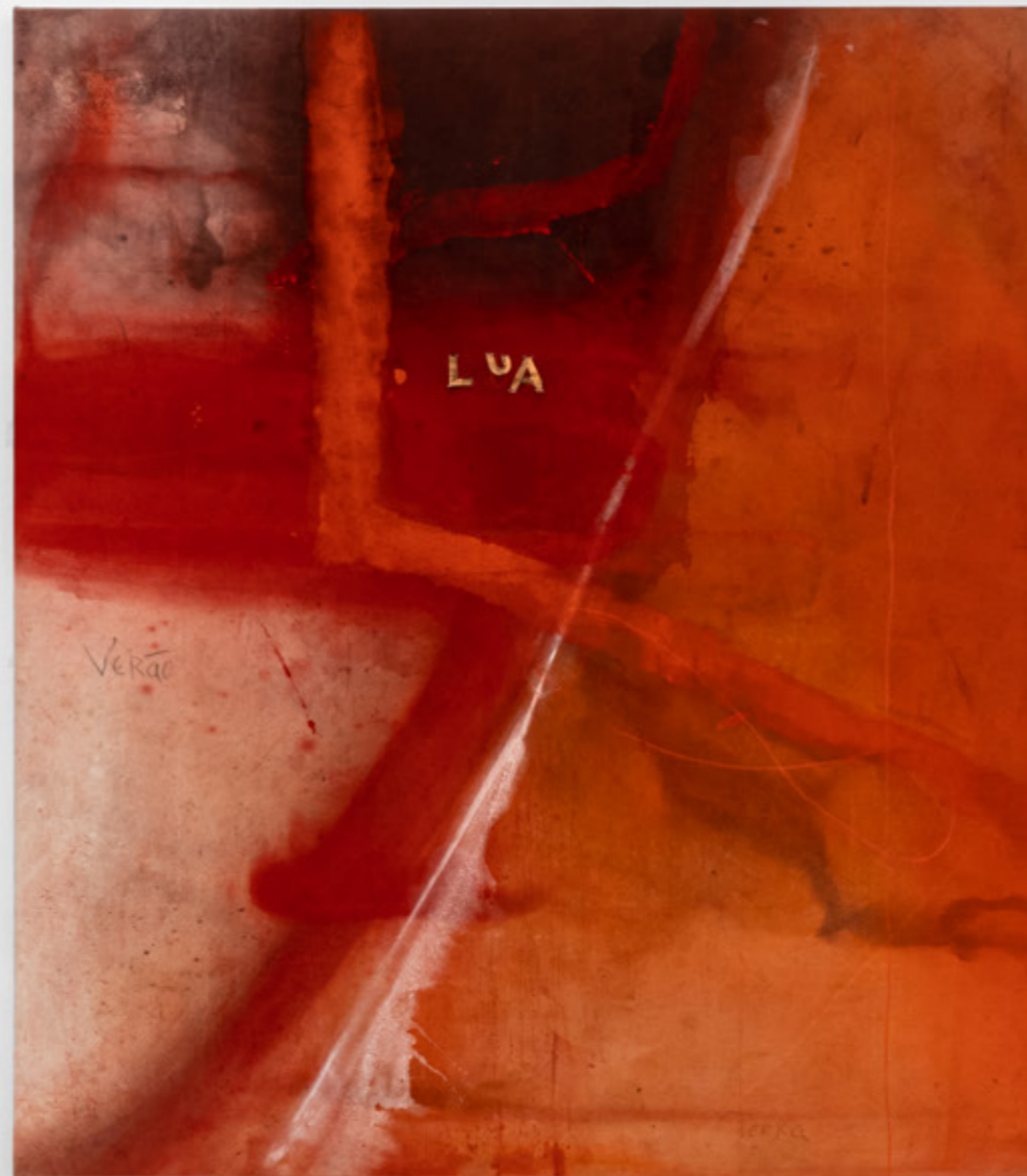
Dentro , 2015 pigments in acrylic medium and copper cutout on canvas 196 x 170 cm/77.2 x 66.9 in