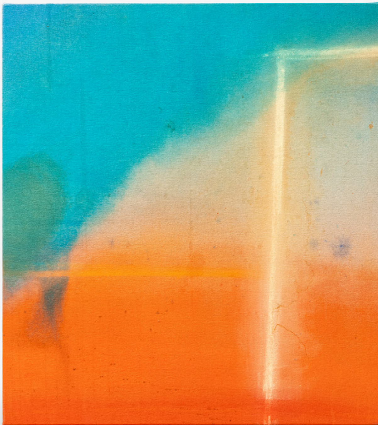
Entre nós uma passagem , 2015 pigments on acrylic medium, dry pastel and rain stain 68 x 63 cm/26.8 x 24.8 in