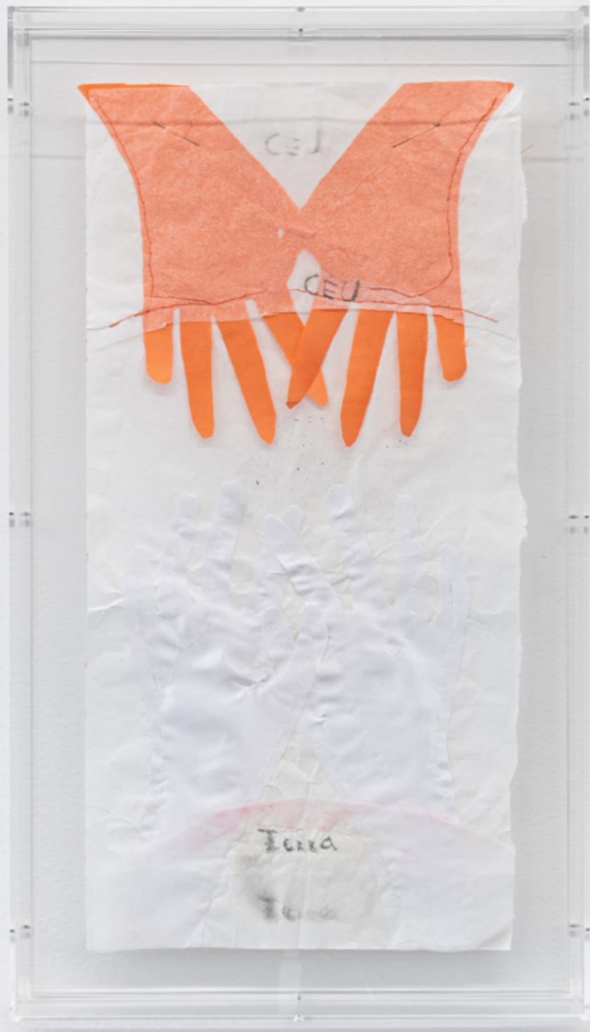
Sem título , 2016 monotype, fabric and needle on Japanese paper 49 x 24 cm/19.3 x 9.4 in