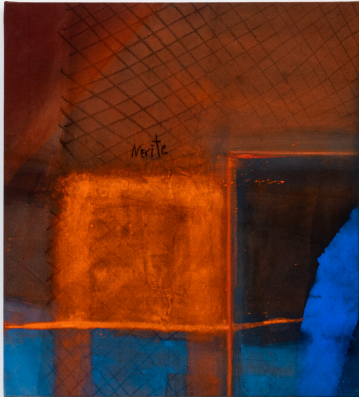
Com Sol , 2015 pigments in acrylic medium and dry pastel on canvas 98 x 87 cm/38.6 x 34.3 in