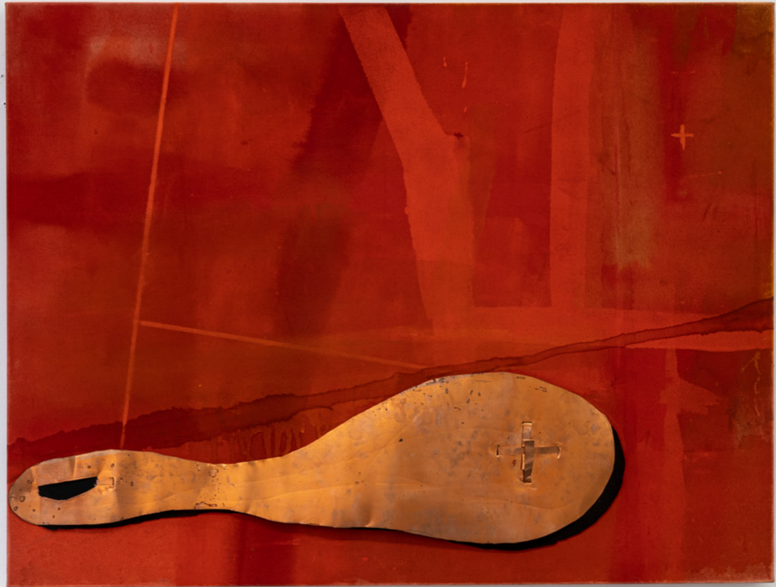
Cosmos , 2008 pigments in acrylic medium and copper on canvas 95 x 125 cm/37.4 x 49.2 in