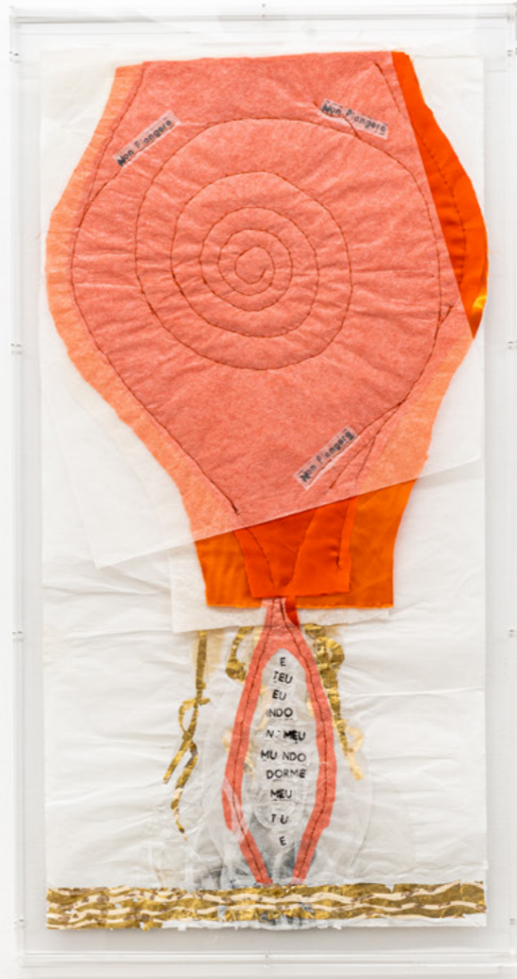
Meu eu , 2016 cotton felt, satin and gold leaves on Chinese paper 102 x 52 cm/40.2 x 20.5 in