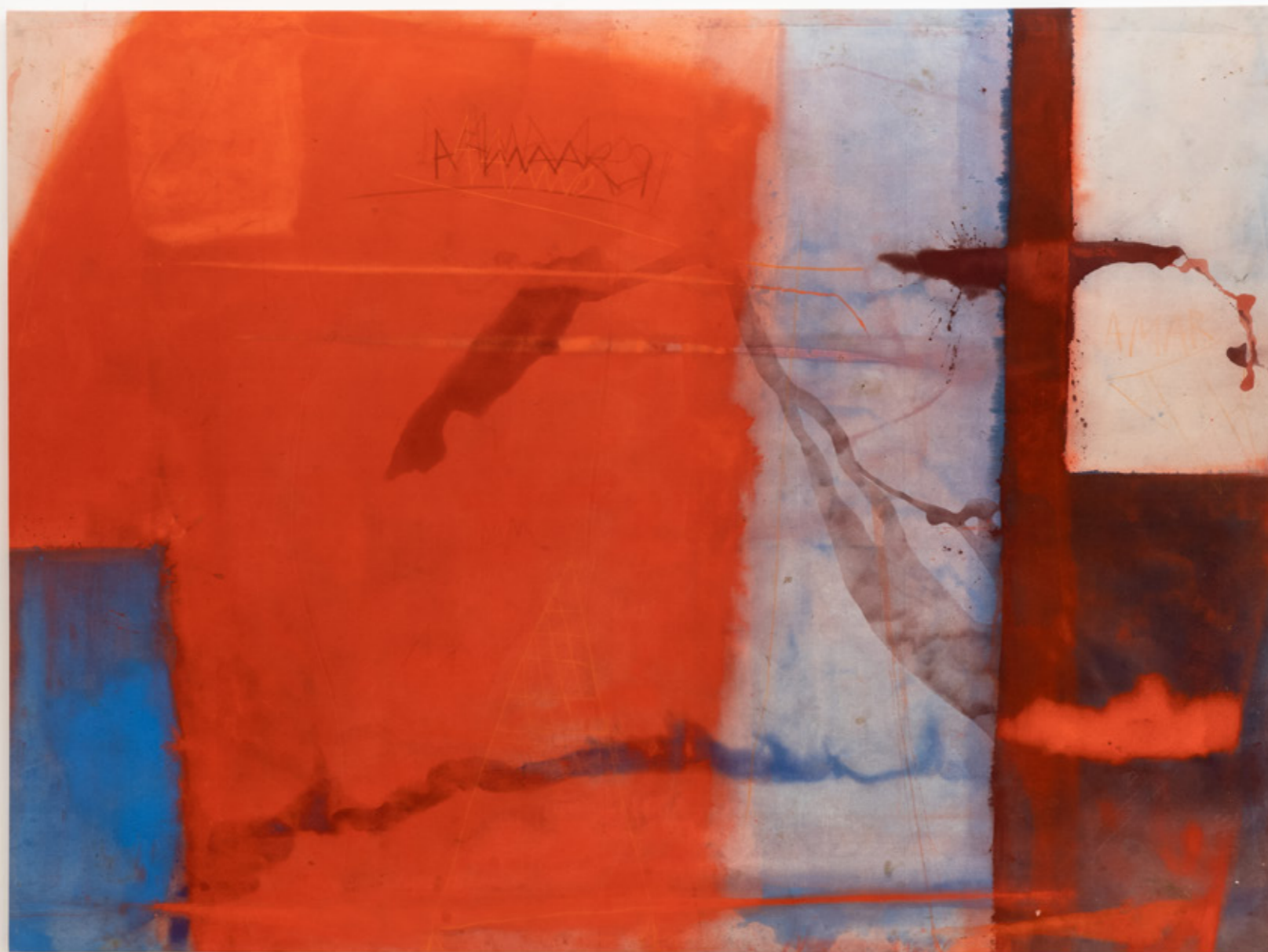
Amar , 2017 pigments in acrylic medium and dry pastel on canvas 213 x 275 cm/83.9 x 108.3 in