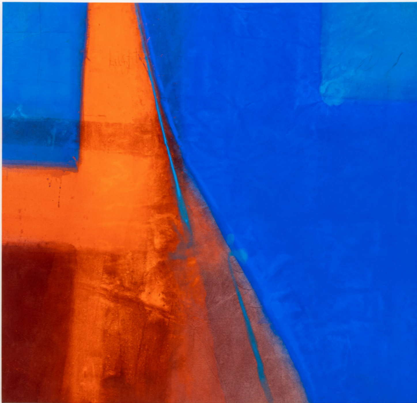
Men and Woman , 2018 pigments in acrylic medium and charcoal on canvas 162 x 168,5 cm/63.8 x 66.3 in